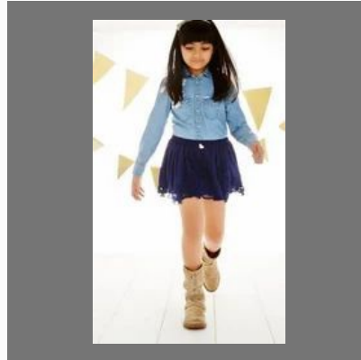
Gabriella Girl Top