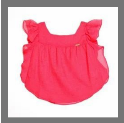
Flo Dobby Girl Top