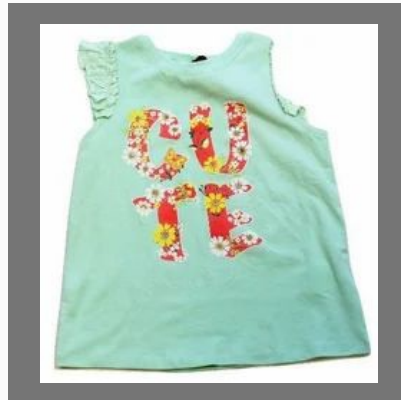
Mercury Girl Top