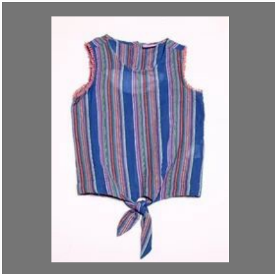
Sadie Girl Top