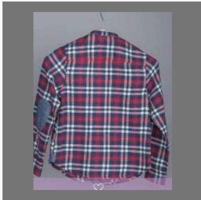
Tom Cru Check Shirt