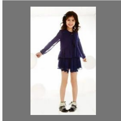
Elle Blouse Girl Top