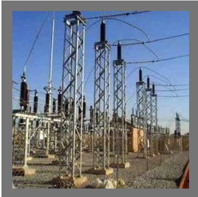
Industrial Electrification Work