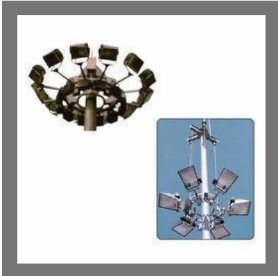
High Mast Lighting