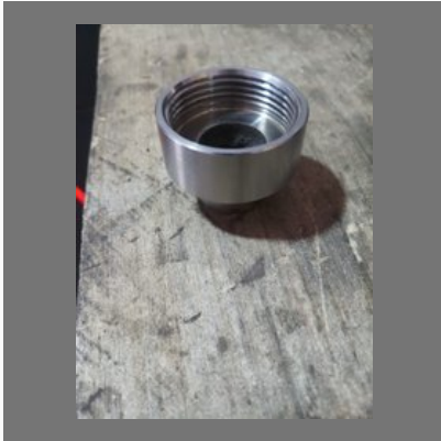
CNC Turning Job Works