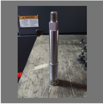
CNC Machine Job Works