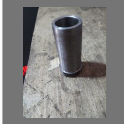
CNC Turning Job Works