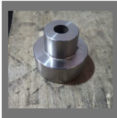
CNC Turning Job Works