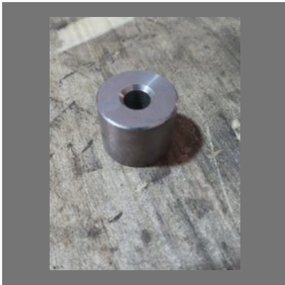
CNC Job Works