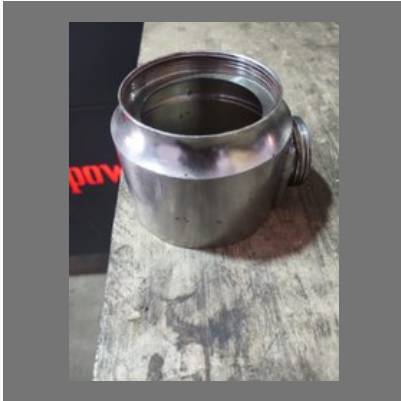
CNC Machine Job Works