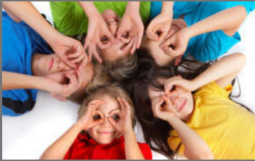
Pediatric Occupational Therapy