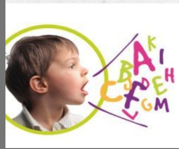
Child Speech Delay Therapy