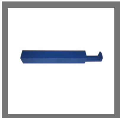
Threading Boring Tool