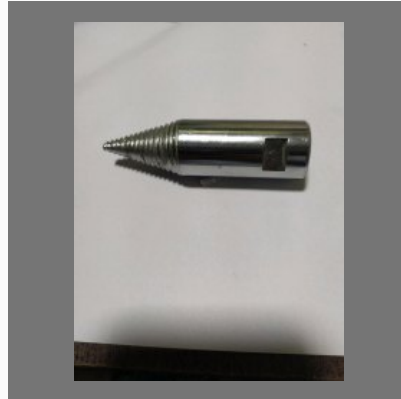
Buffing Chedda tools