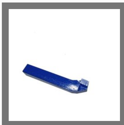
Tungsten Carbide Tipped Tool