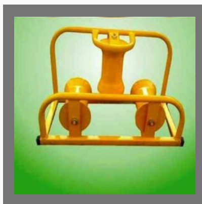
Cable Corner Roller