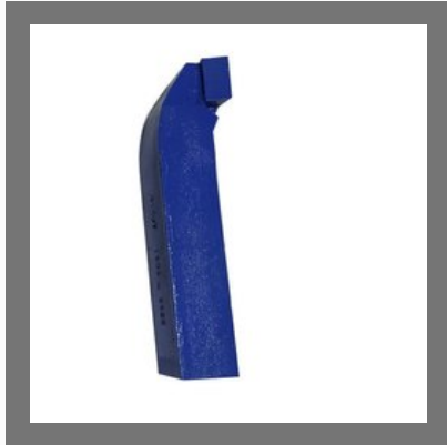
Knife Face Carbide Cutting Tool