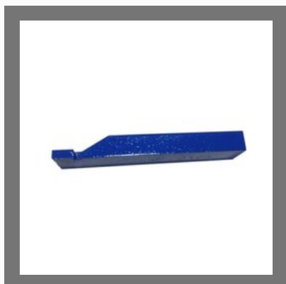
Parting Tool Carbide