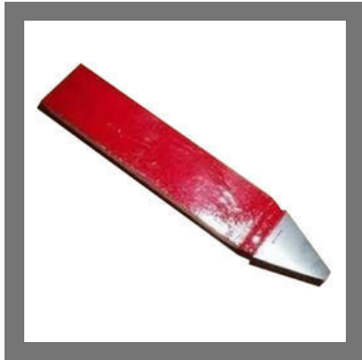
Roller Grooving Tool