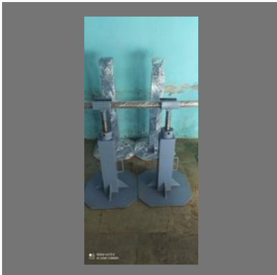
Cable Drum Screw Jacks 5 Ton