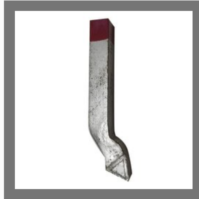
Tungsten Carbide Tipped Tool