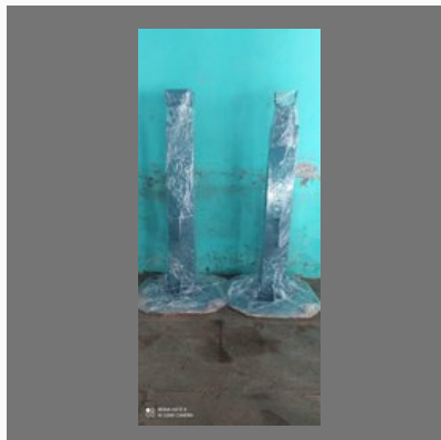
Cable Drum Screw Jacks 10 Ton