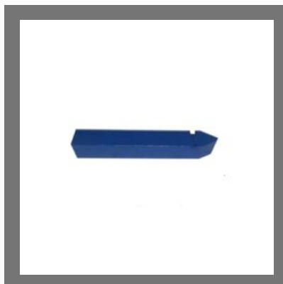
5/8" Lathe Tool