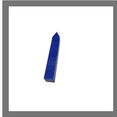
Lathe Turning Tool