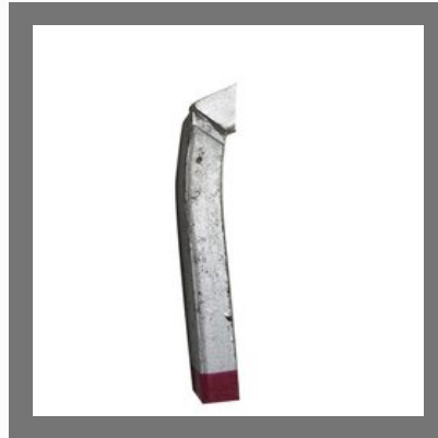
Carbide Tipped Tool