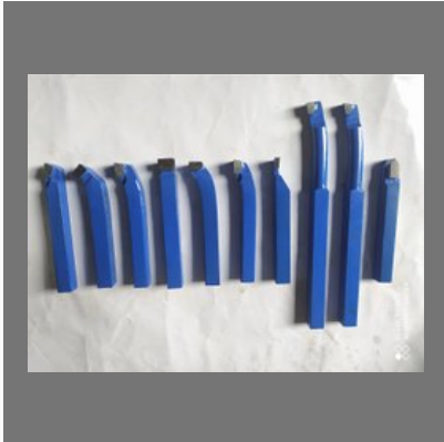
Carbide Tipped Brazed Tools