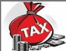
Compliance Under Taxation