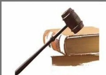
Compliance With Legal Statutes