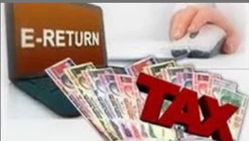
Taxation And Filing Service