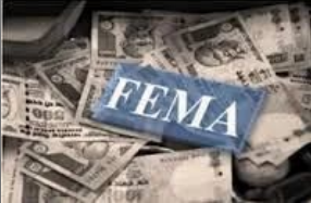
Compliance with FEMA