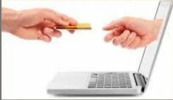
Transaction Processing Service