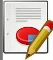
Custom Reporting Services