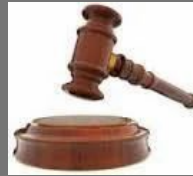
Compliance With The Indian Companies Act