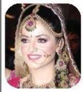
Special and Attractive Bridal Packages