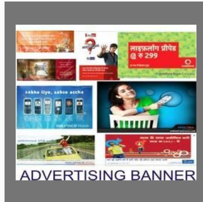
LD Foam Sheet