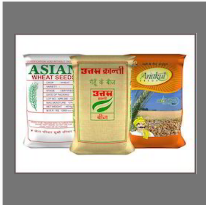
PP / HDPE Woven Bags Sacks (Laminated/Unlaminated)