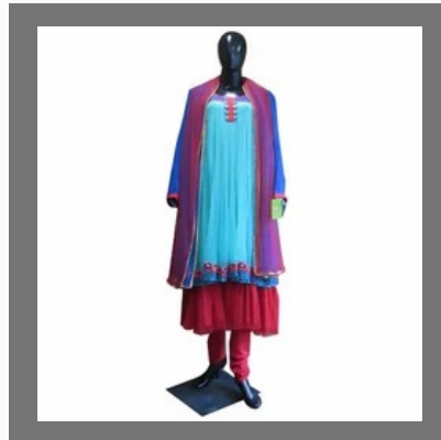
Designer Ladies Ethnic Wear