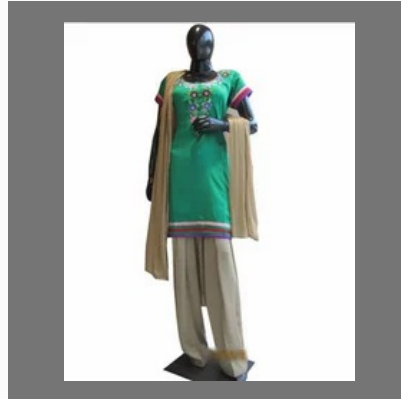
Indian Women Salwar Kameez