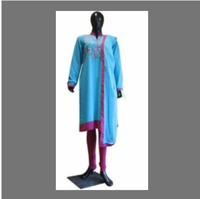
Traditional Salwar Suits