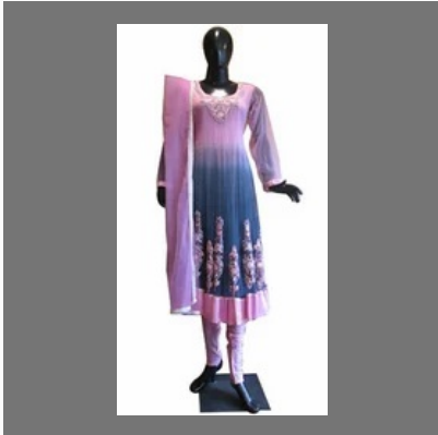
Girls Ethnic Wear