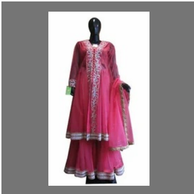
Designer Ethnic Wear