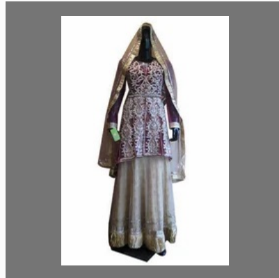
Tesco Ladies Party Wear