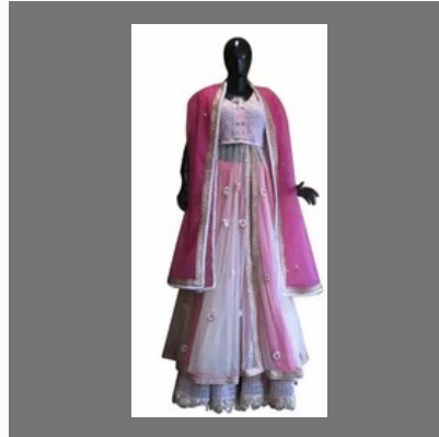
Ladies Party Wear Dress