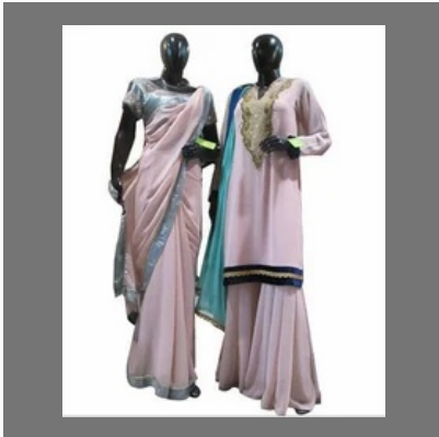
Womens Indian Clothing