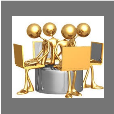
Online Commodities Broking Services