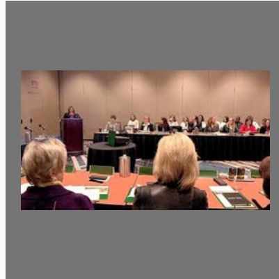
Commodities E-Research Service