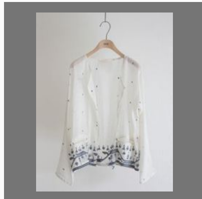
Khadi Cotton Jamdani Jacket