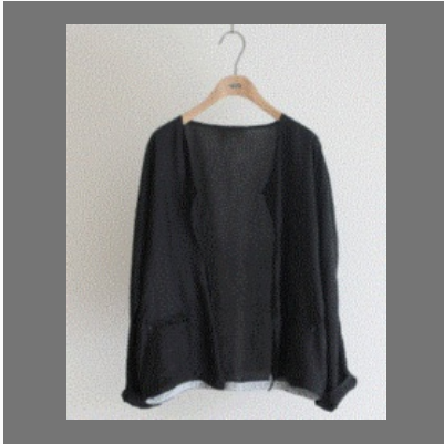
Handloom Silk Jacket