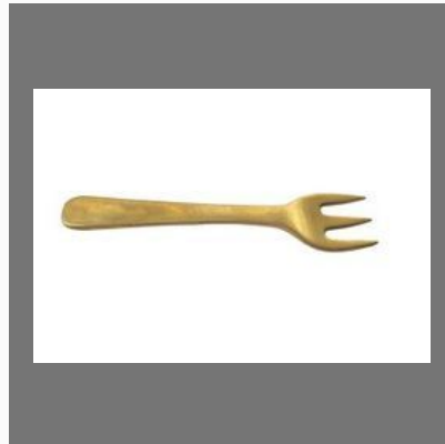
Brass Fork Spoon