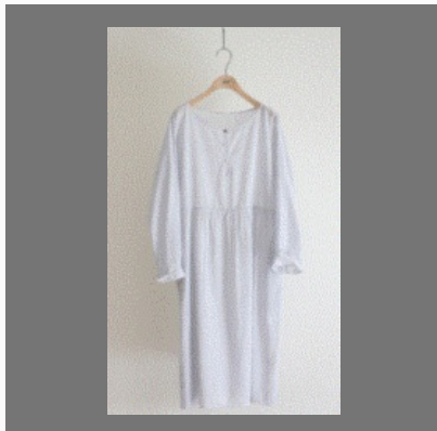
Khadi Cotton Stripe One Piece