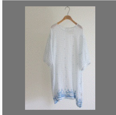
Khadi Cotton Jamdani One Piece