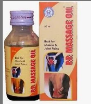
PP Massage Oil