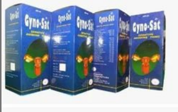
Glyno Sat Syrup