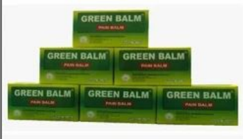
Green Balm Pain Balm