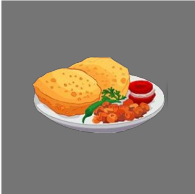
Buffet Lunch And Dinner For Party Orders