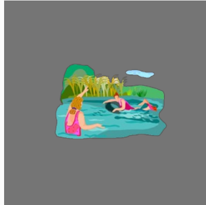
Swimming Pool And Club House