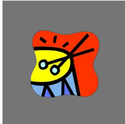
Live Musical Programmed