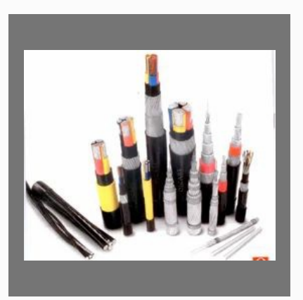
Cables & Wires