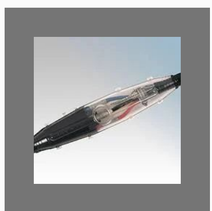
Cable Joint Kits