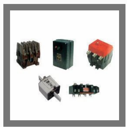
Contactors & Relays