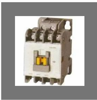
Electrical Contractor Relays