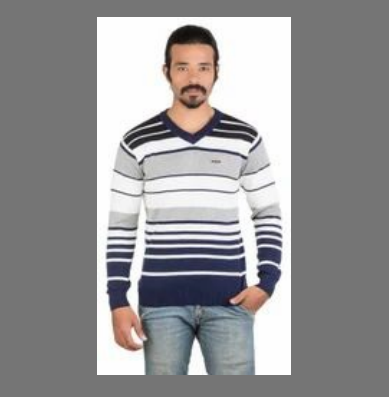
Mens Flat Knit T Shirt