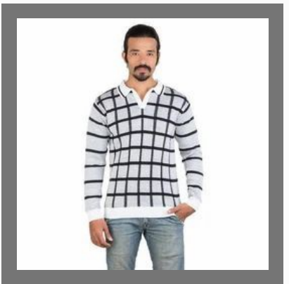
Mens Collar Flat Knit T Shirt