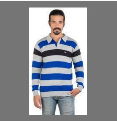
Mens Collar Flat Knit T Shirt