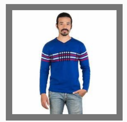
Mens T Shirt