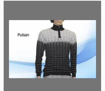
Mens Black and White Sweatshirt