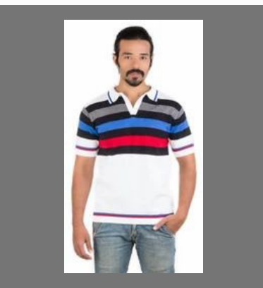
Mens Flat Knit T Shirt