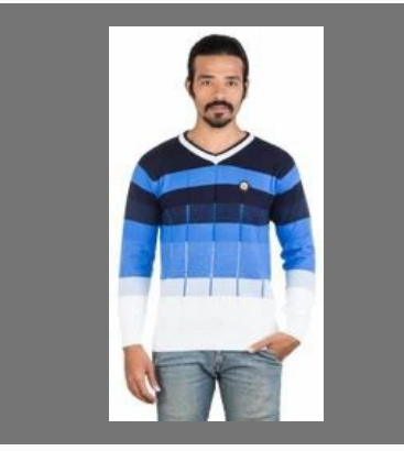
Mens Flat Knit T Shirt