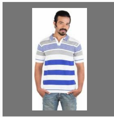
Mens Flat Knit T Shirt