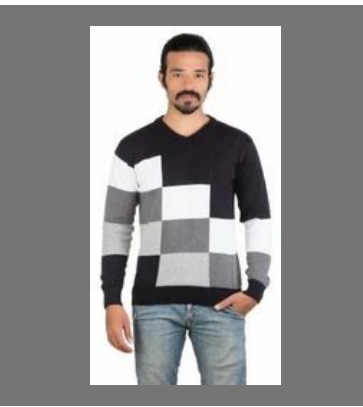
V Necked Full Sleeved Sweat T Shirt