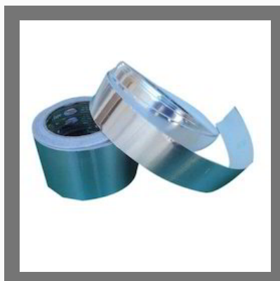
Aluminum Foil Tape