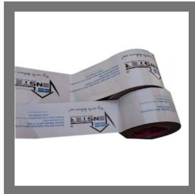
Printed SPF Tape