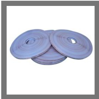
Sunking Tape ( Bag Sealing Tape )