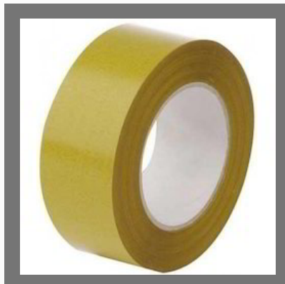
Double-sided Adhesive Tape