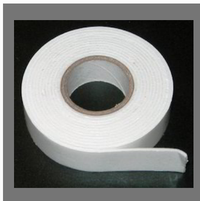
Double Side Foam Tape