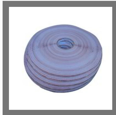
Sealing Tape ( Bag Sealing Tape)