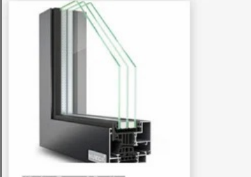
Window Frame And Profiles