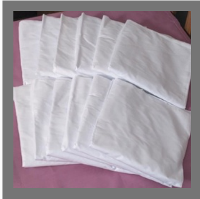
Hospital Bed Sheets Material