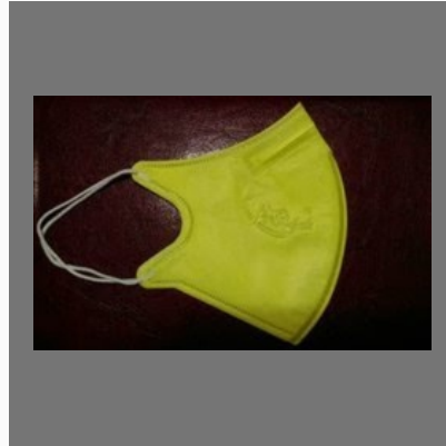
Safety Face Mask