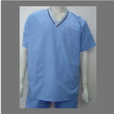
Hospital Nurse Dress