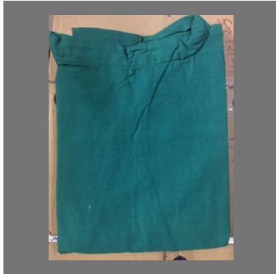
Operations Theater Dress