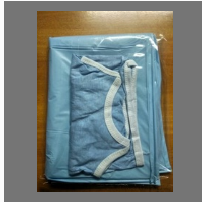
New Born Baby Dress Set