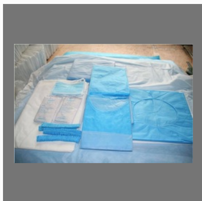
Hospital Staff Uniform