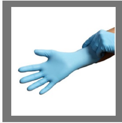
Hospital Hand Glove