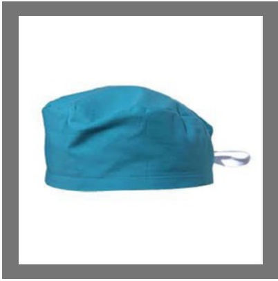
Hospital Head Cap