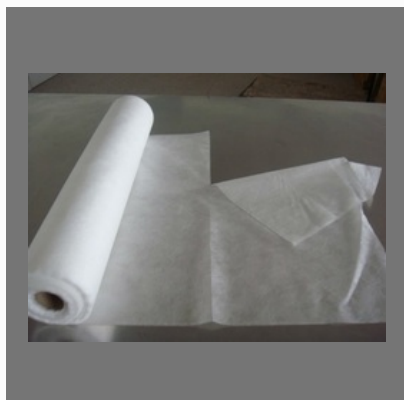
Hospital Towel Material