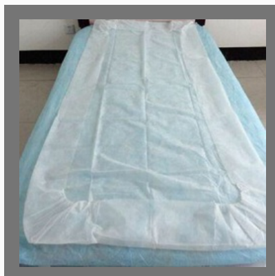
Hospital Bed Sheets