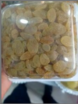
Classic Selected Raisins