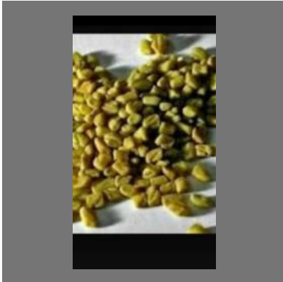
Green Methi Seeds