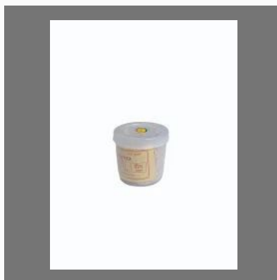
Heera Hing Powder