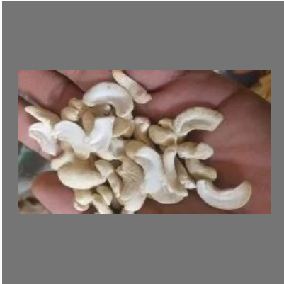
JH Cashew Nut