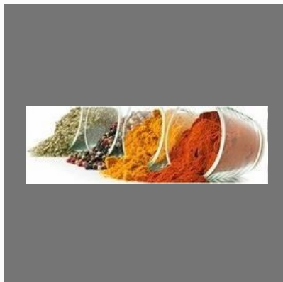
Natural Mix Spices