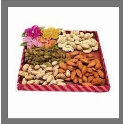
Assorted Dry Fruits