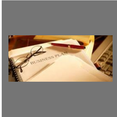
Business Advisory Services