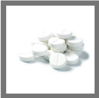
Pharma Franchise for Kadapa