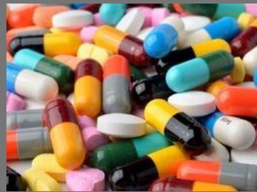
Pharma Franchise for Cachar