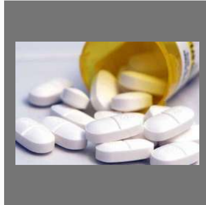
Pharma Franchise for Jalgaon