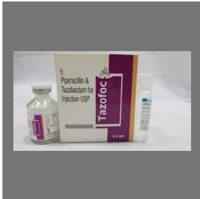
Piperacillin and Tazobactam for Injection 4.5 gm