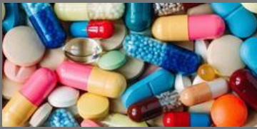
Pharma Franchise for Bongaigaon