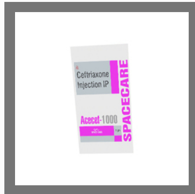
Ceftriaxone Injection IP