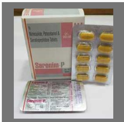
Nimesulide, Paracetamol And Serratiopeptidase Tablets