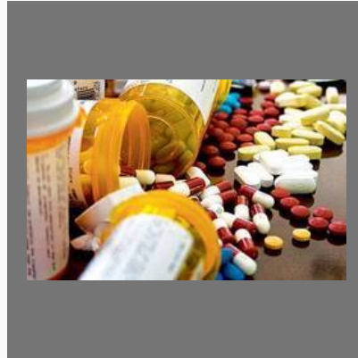
Pharma Franchise for Muzaffarpur