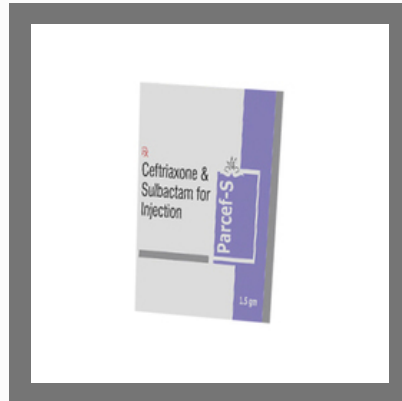
Ceftriaxone and Sulbactam Injection 1.5 gm