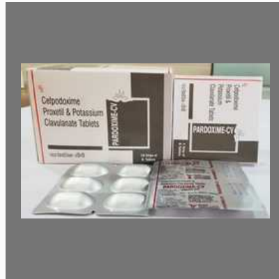
Cefpodoxime Proxetil And Potassium Clavulanate Tablets