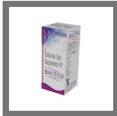
Cefixime Oral Suspension IP