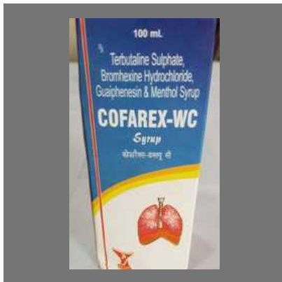
Terbutaline Sulphate Bromhexine Hydrochloride Guaiphenesin And Menthol Syrup