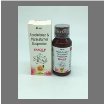
Pharma Franchise for Madhubani