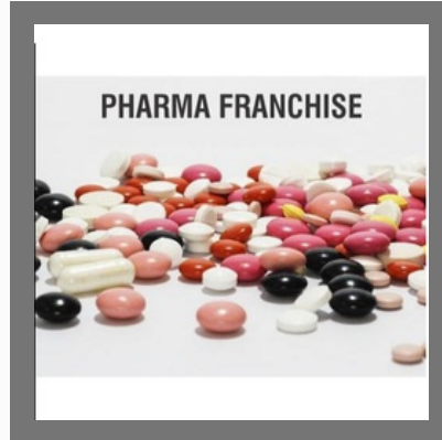
Pharma Franchise for Guntur