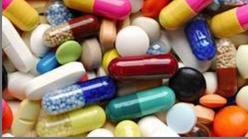
Pharma Franchise for Baksa