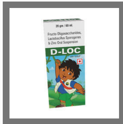
Fructo Oligosaccharides Lactobacillus Sporogenes Zinc Oral Suspension