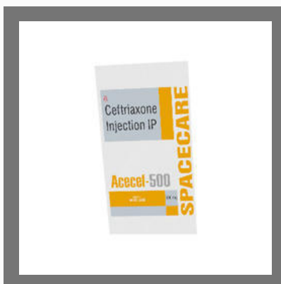
Ceftriaxone Injection 500 Mg IP