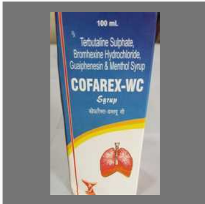
Terbutaline Sulphate, Bromhexine Hydrochloride Syrup