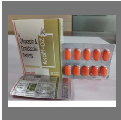
Ofloxacin and Ornidazole Tablets