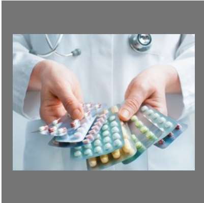
Pharma Franchise Opportunity In Satara