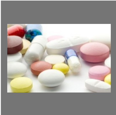
Pharma Franchise for Aurangabad