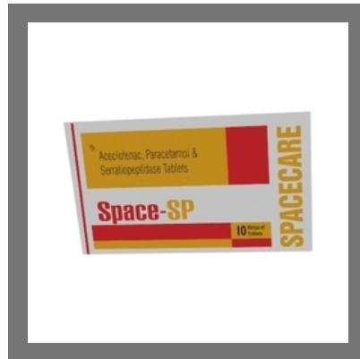
Aceclofenac, Paracetamol And Serratiopeptidase Tablets