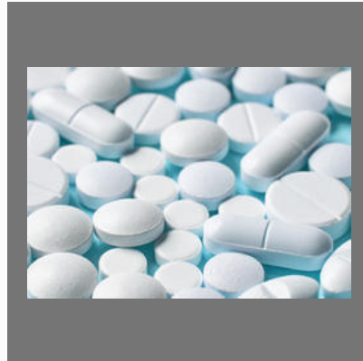
Pharma Franchise in Ahmednagar