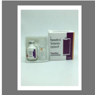
Pharma Franchise For Darbhanga