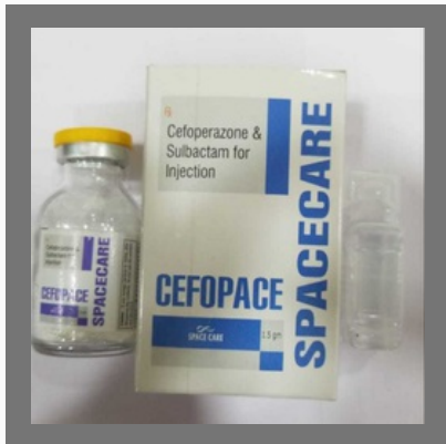
Cefoperazone and Sulbactam for Injection