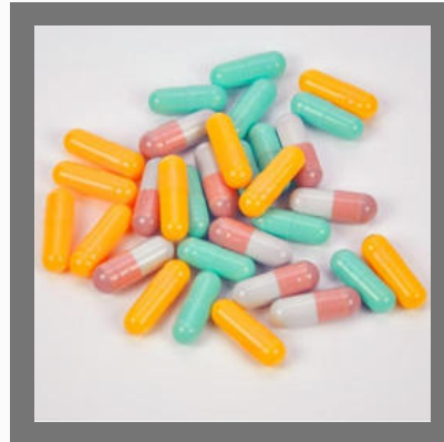
Pharma Franchise Opportunity for Kurnool