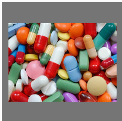
Pharma Franchise for Darbhanga