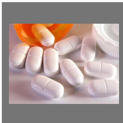
Pharma Franchise in Nagpur