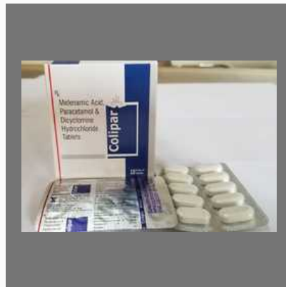
Mefenamic Acid, Paracetamol and Dicyclomine Hydrochloride Tablets