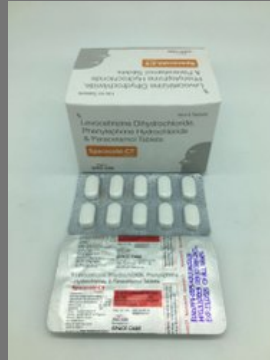
Pharma Franchise For North Lakhimpur