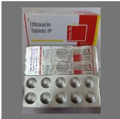
Ofloxacin Tablets IP