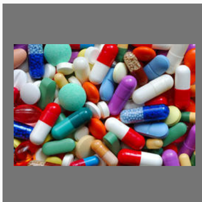
Pharma Franchise for Karimganj