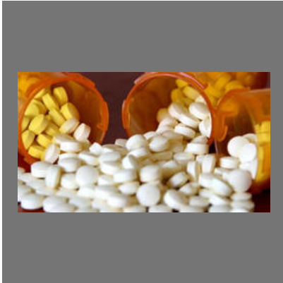
Allopathic PCD Pharma Franchise for Aurangabad