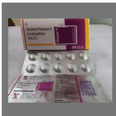
Diclofenac Potassium And Serratiopeptidase Tablets