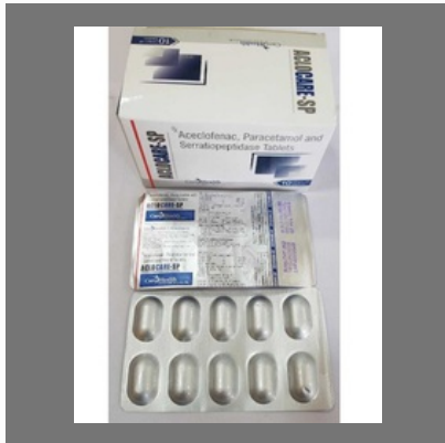
Aceclofenac Paracetamol And Serratiopeptidase Tablets