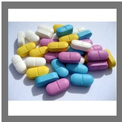
Piroxicam Dispersible Tablets