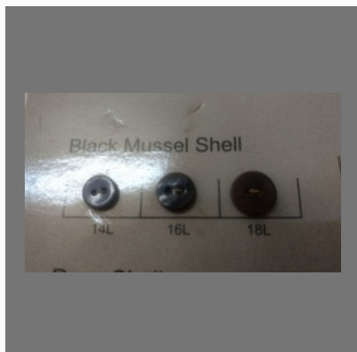
Black Mushell Shell Button