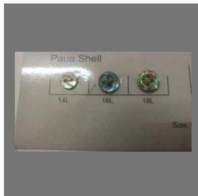
Paua Shell Button