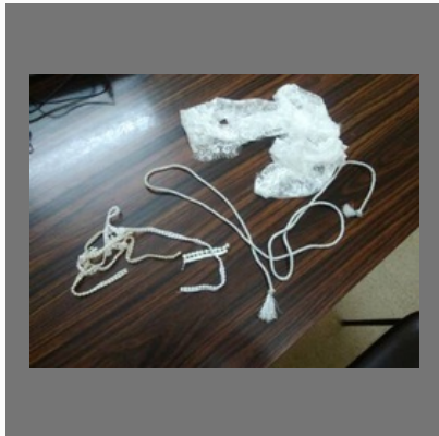
Ladies Suit Laces