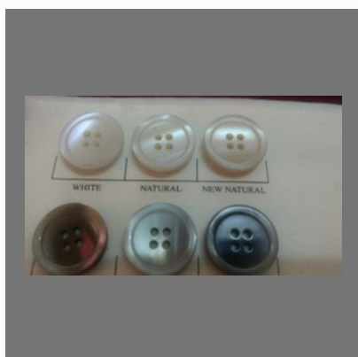
Lazer Shell Button