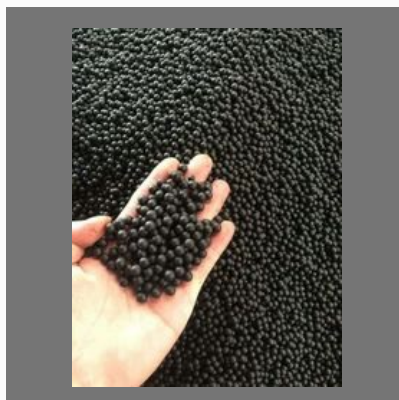
Humic Amino Shiny Balls