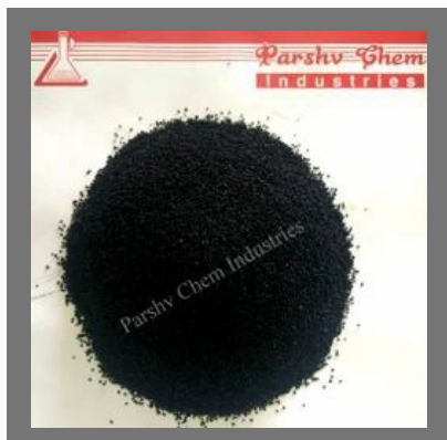
Double Roasted Bentonite Granules