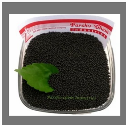
Bentonite Round Balls