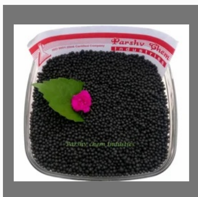
Humic Amino Granules