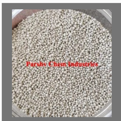
Silicon Fertilizer Granules