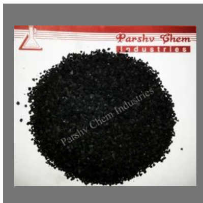
Roasted Bentonite Granules