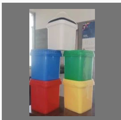
Plastic Square Bucket For 10 Kg