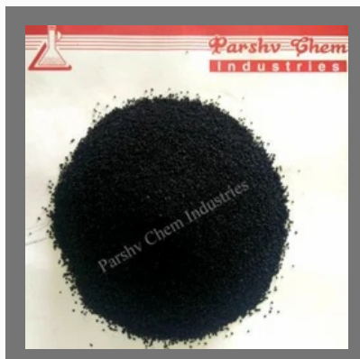
Black Bentonite Granules