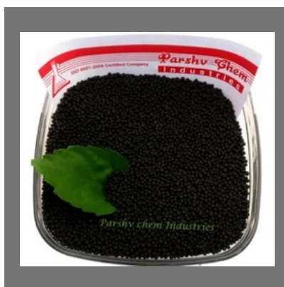
Zyme Round Balls