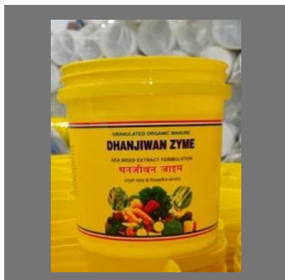
Zyme Granules 10 Kg Pack