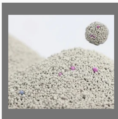
Bentonite Cat Litter