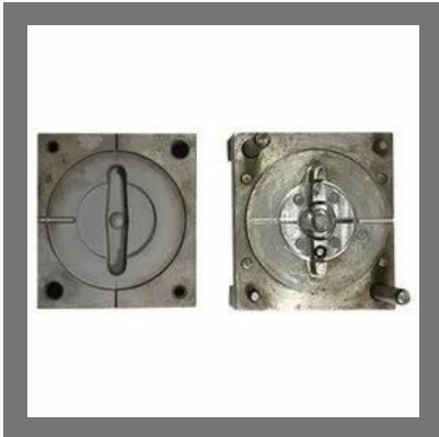
Plastic Engine Moulding Die