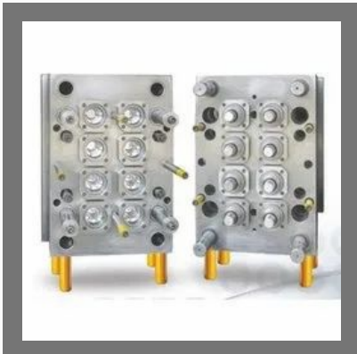
8 Cavity Cap Mould