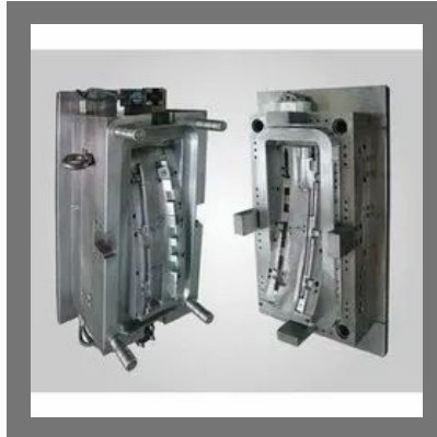
Plastic Injection Mould