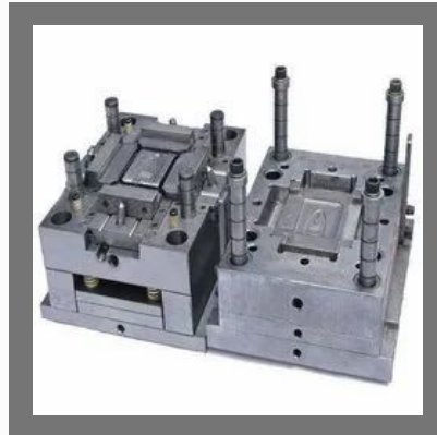
Plastic Injection Moulding Die