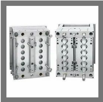
12 Cavity Plastic Injection Mould