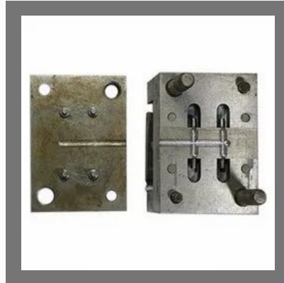
Injection Moulding Die