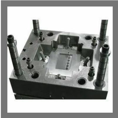
Industrial Plastic Injection Mould