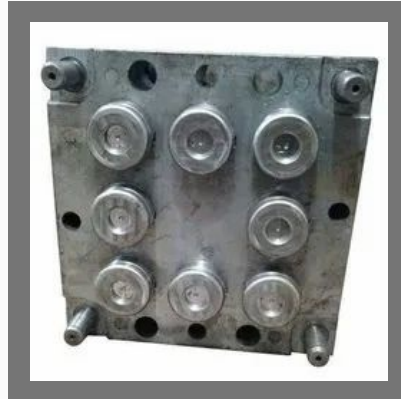
Plastic Jar Cap Mould