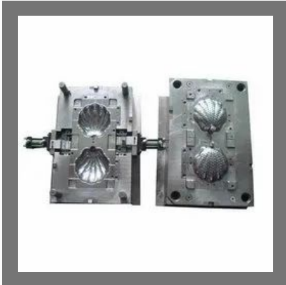
Cold Rolled Injection Moulding Die