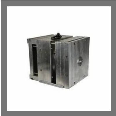
Industrial Injection Moulding Die