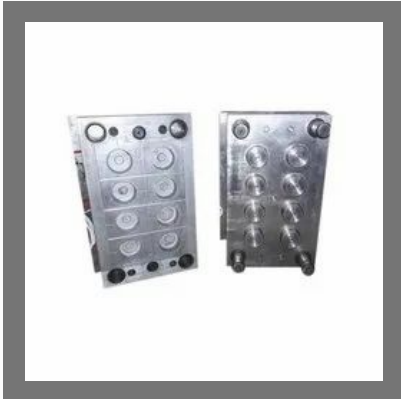
Plastic Cap Mould