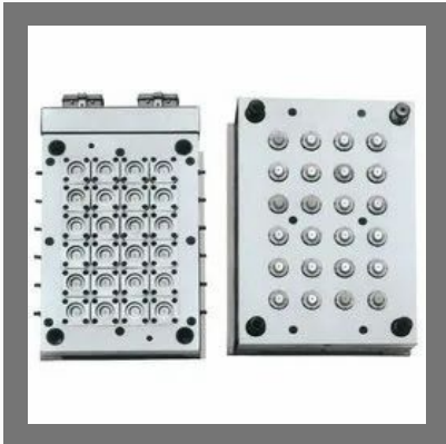
Stainless Steel Pet Preform Mould