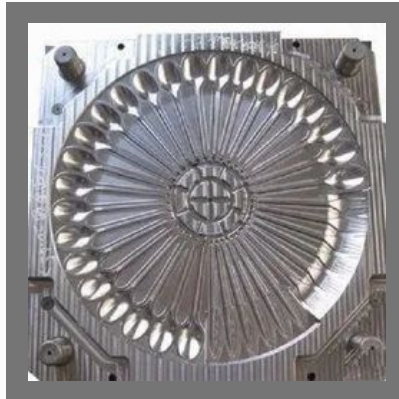
Plastic Spoon Mould