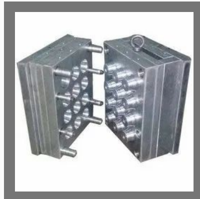
Stainless Steel Cap Mould