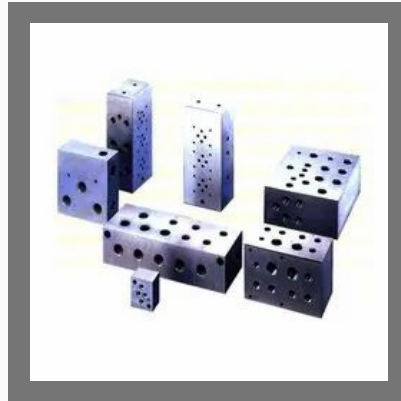
Hydraulic Custom Manifold Block