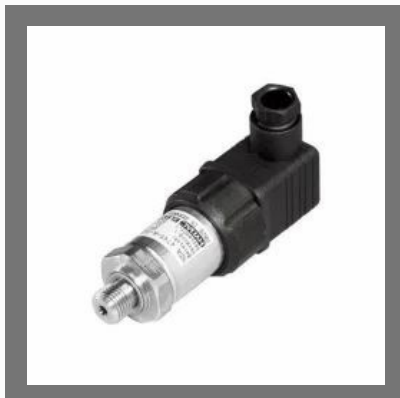
Digital Pressure Transmitter