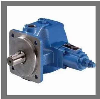
Variable Vane Pump