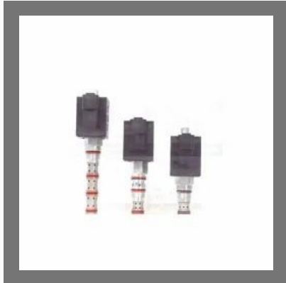
Cartridge Directional Control Valve