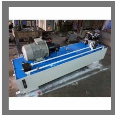
2HP Hydraulic Power Pack