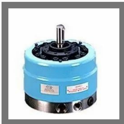
Radial Piston Pump