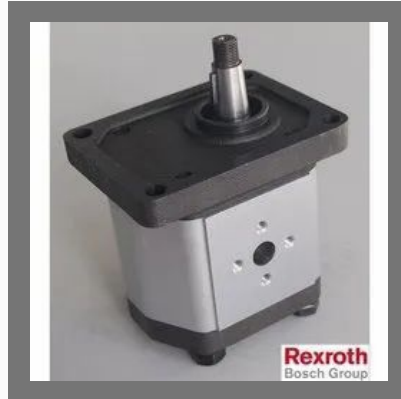
Hydraulic Gear Pump