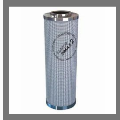
Exapor Max 2 Filter Element