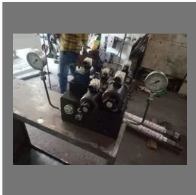
Hydraulic Manifolds FOR SHEARING MACHINE