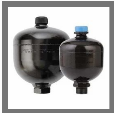
Bladder Hydraulic Accumulator