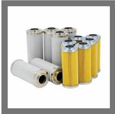
Element Replacement Hydraulic Filter