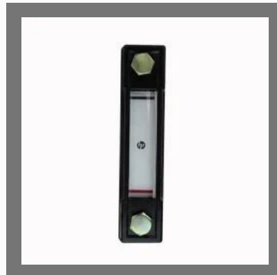
Hydroline Oil Level Gauge