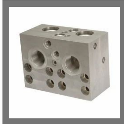
Hydraulic Manifold Connecting Plate