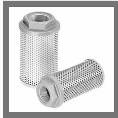
Round Suction Strainer Filters