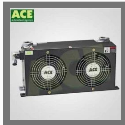
ACE AH-0608L Air Cooled Oil Cooler