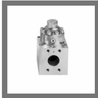
Hydraulic Cartridge Valve