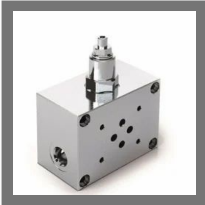
Hydraulic Manifold Block