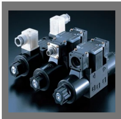
Solenoid Operated Hydraulic Directional Control Valve