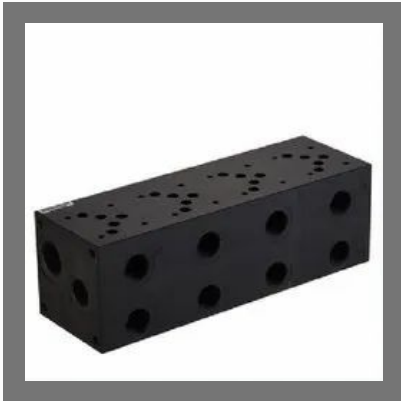
Hydraulic Manifold Block