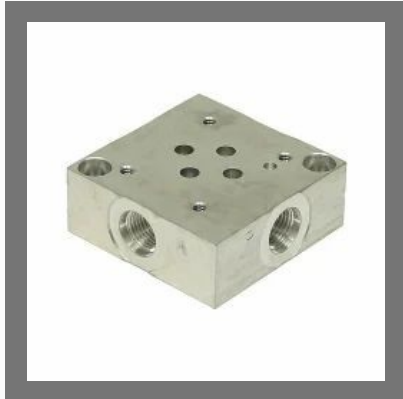
Manifold Connecting Plate