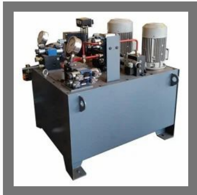
20HP Hydraulic Power Pack