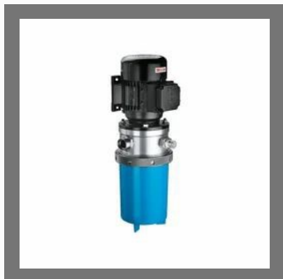
MS Offline Filter