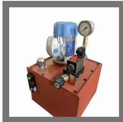
15HP Hydraulic Power Pack