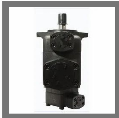
Double Vane Pump