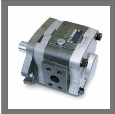
Internal Gear Pump