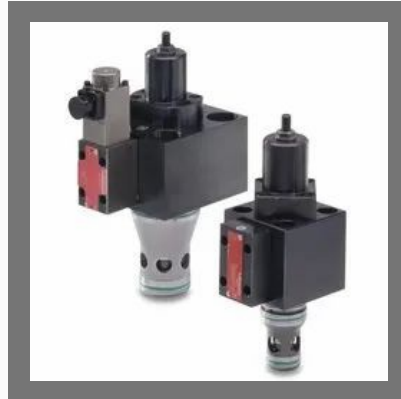
Hydraulic Cartridge Valves