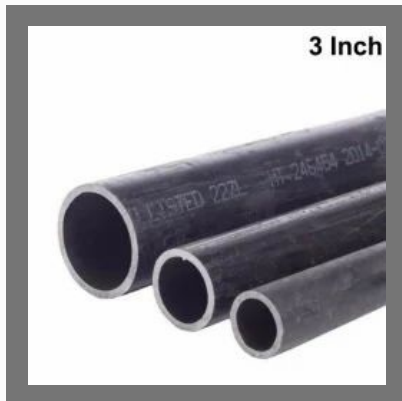
3 Inch Carbon Steel Pipe