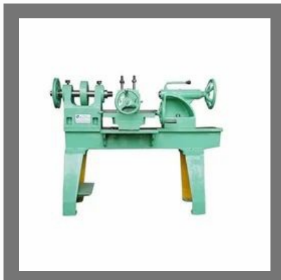
Spinning Cutting Machine