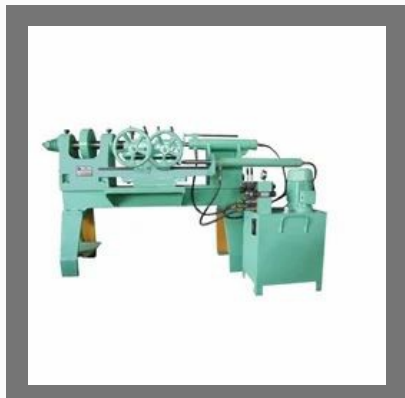
Hydraulic Spinning Rolling Machine