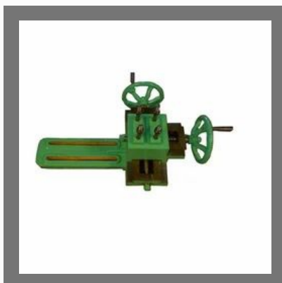
Quick Action Tailstock