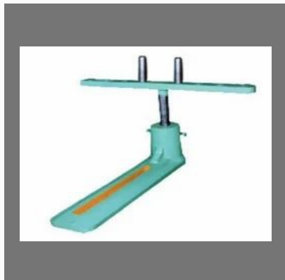
Aluminum Slide Attachment