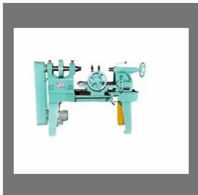
Spinning Rolling Machine