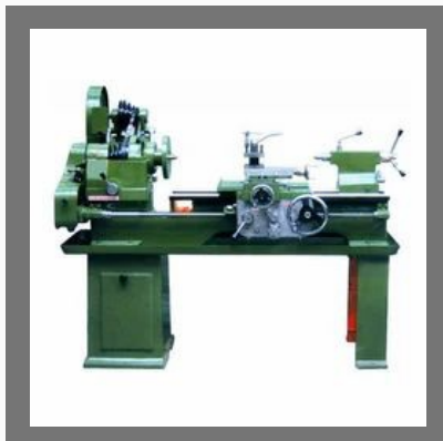
Metal Spinning Lathe Machine