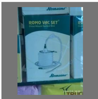
Romo Vac Sets