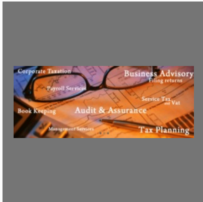
Audit And Assignments Services