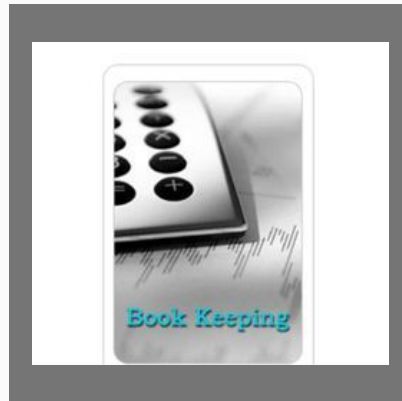
Book Keeping And Accountancy