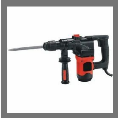
Hitachi - Power Tool