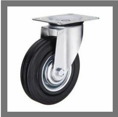
Steel Caster Wheel