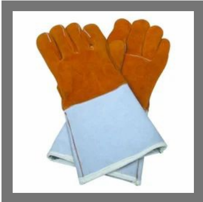
Heat Resistant Gloves