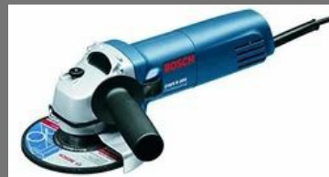
Ag 4 Grinder Machine