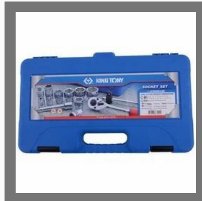
Taparia Wrench Set