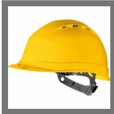
Quartz Safety Helmet