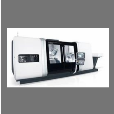
CNC Turn & Mill Complete Machining Center