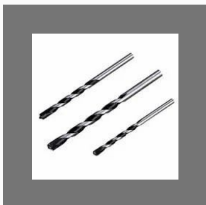
Solid Carbide Drills & End Mills