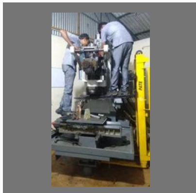
Retro Fit and CNC Machine Reconditioning