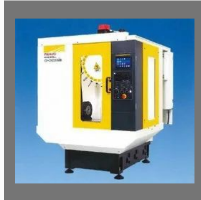
Fanuc Robo Drill Machine