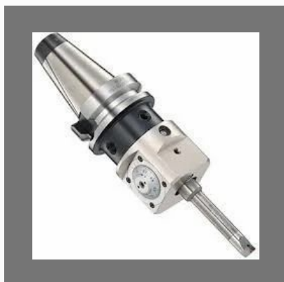
Nikken Boring Bar