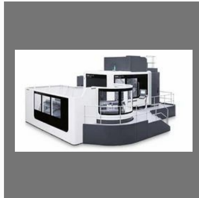
Universal Machining Centres for 5-sided / 5-axis Machining