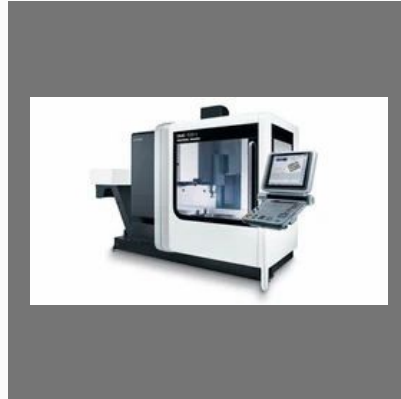
DMG More Vertical Lathes