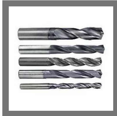
Solid Carbide Drills