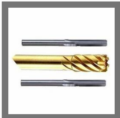
Solid Carbide Reamers