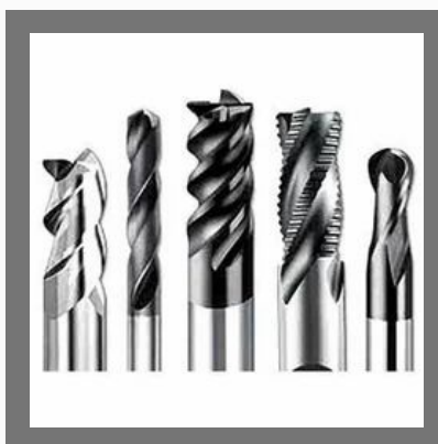
Solid Carbide End Mills