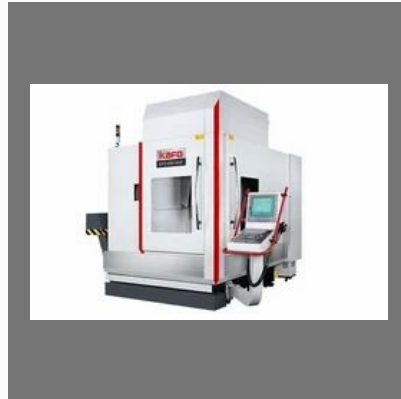
5 Axis Simultaneous Machining Center