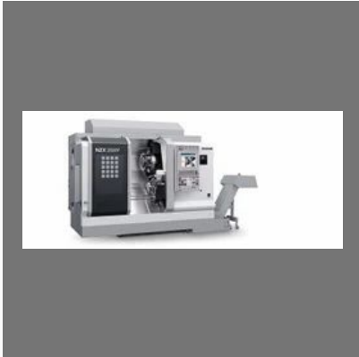
CNC Turning Center