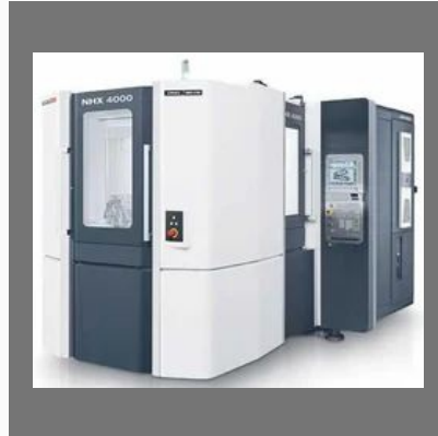
Horizontal Machining Center