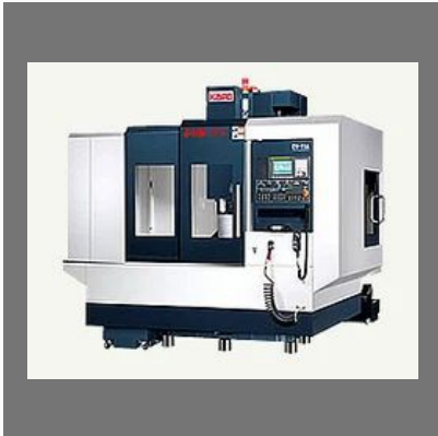
Vertical Machining Center