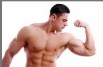
Health Club Services