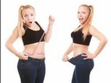
Weight Loss Health Club Services