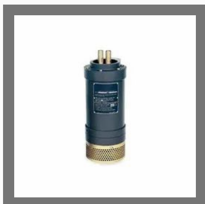
Spata Submersible Construction Dewatering Pump