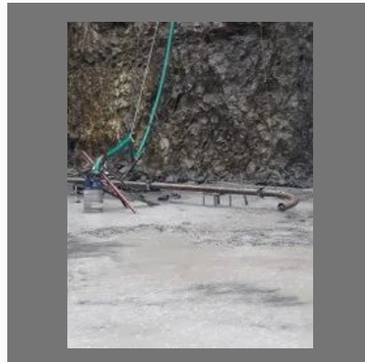
Dewatering Pump On Rent