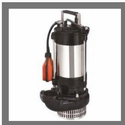
De-watering Submersible Pump