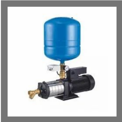
Pressure Booster Pump