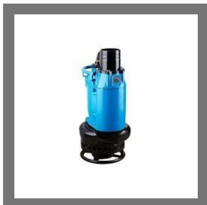
Mody Submersible Dewatering Pump