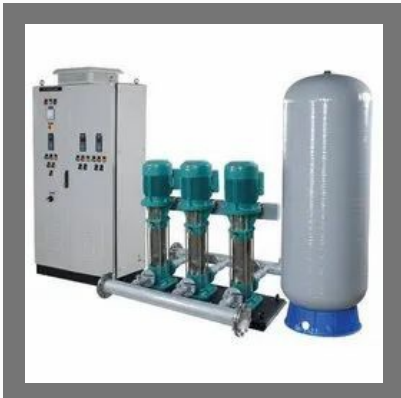
Hydropneumatic Pressure System