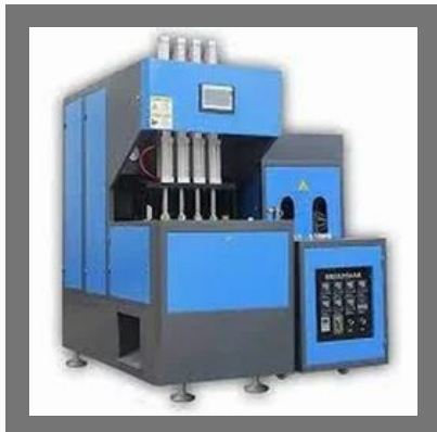
Pet Bottles Making Machine