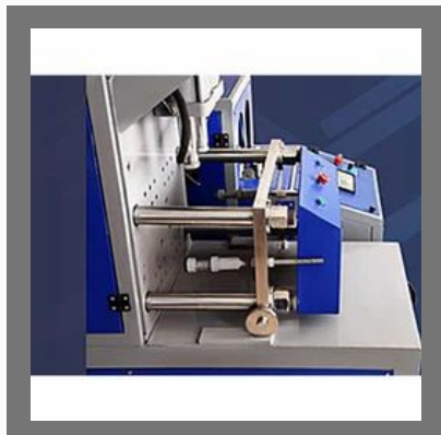
Stretch Blow Moulding Machine