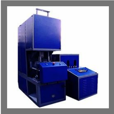
Pet Blow Moulding Machine Maintenance Service