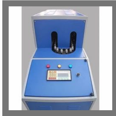
Pet Blow Moulding Machine Repairing Service