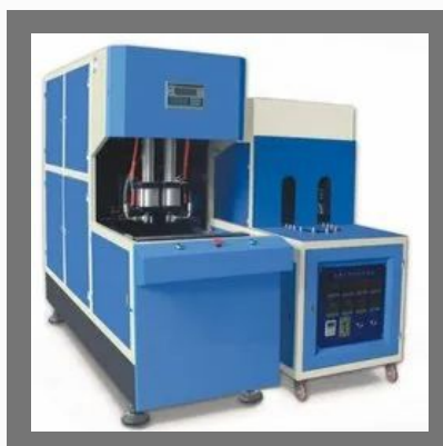
Plastic Bottle Making Machine