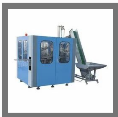
Bottle Making Machines