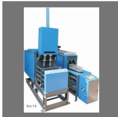
Bottle Blowing Machine