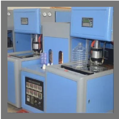
Soda Water Plant