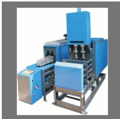
PET BLOWING MACHINE