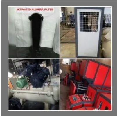
Pet Blowing Machine Set