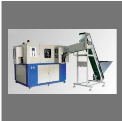
Stretch Blow Molding Machine