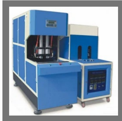
Pet Blow Mould Machine