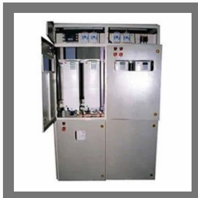
Power Control Centers (PCC)