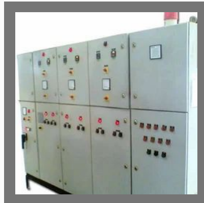
Standard Control Panels