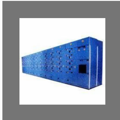
LT Control Panels