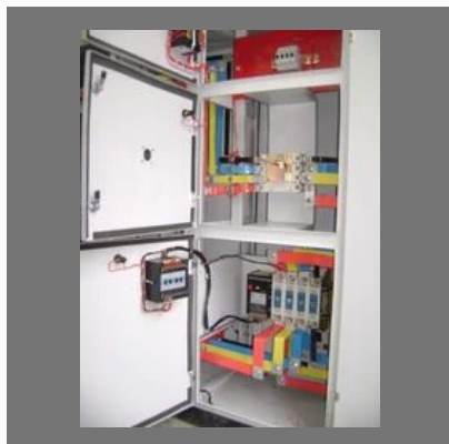
Automatic Transfer Switches Panel