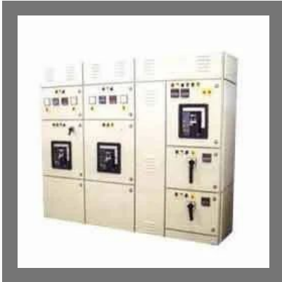
Electric Control Panel Boards