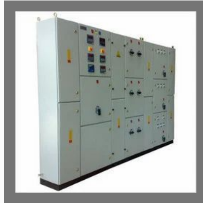
Distribution Panel Boards