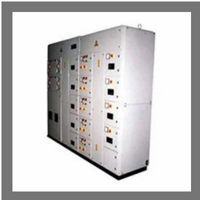
Process Control Panels