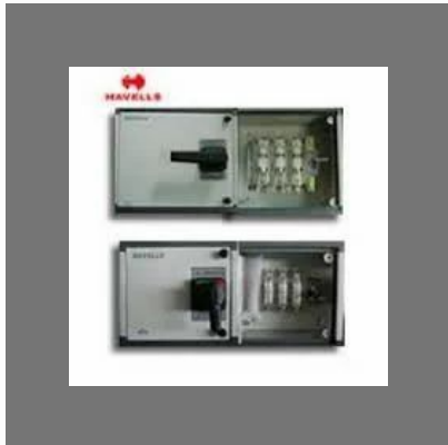
Havells Switch Gears