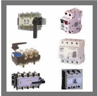
Indo Asian Switch Gear