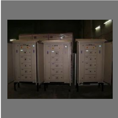
Distribution Board Panel