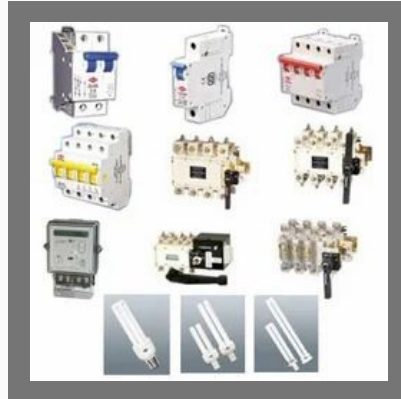
HPL Switch Gears