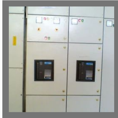
Motor Control Centers (MCC)