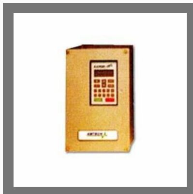
AC Variable Frequency Drives