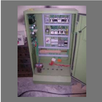
Logix Control Panel