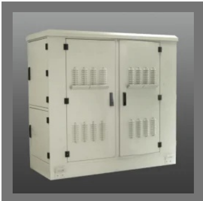
Outdoor Double Door Panel