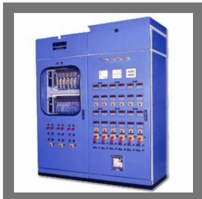
Automatic Power Factor Control Panels (APFC)