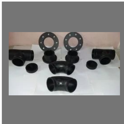
HDPE Pipe Fitting