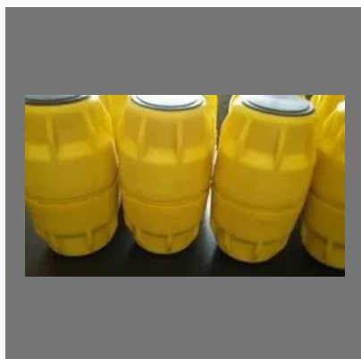
36mm Push Fit Coupler for 5 G Duct