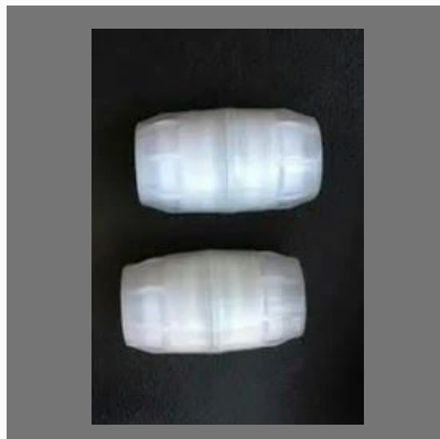
Push Fit Coupler