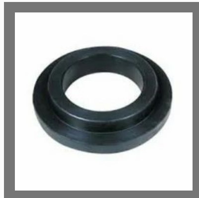
HDPE Pipe End