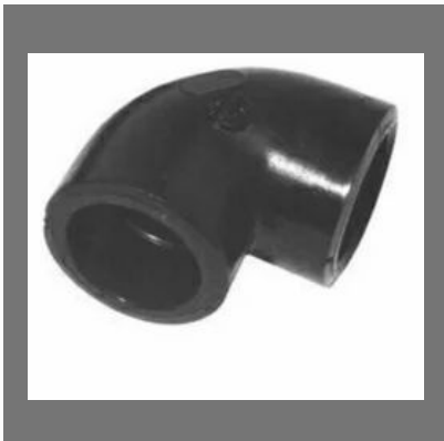
HDPE Bend 20mm to 630mm