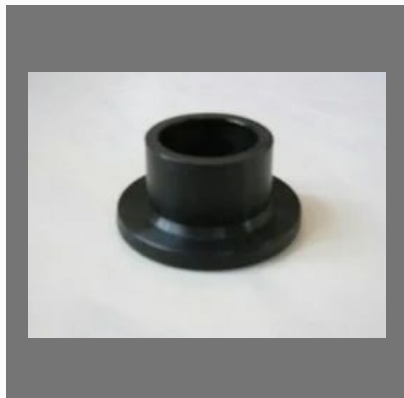
HDPE Long Neck Pipe End