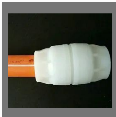
Push Fit Coupler