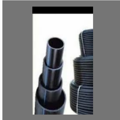
HDPE Pipes 20mm to 1200mm