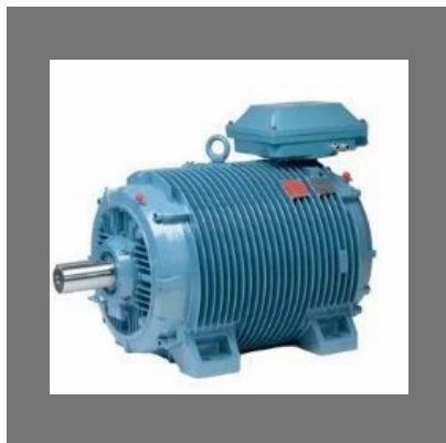
Roller Table Motors