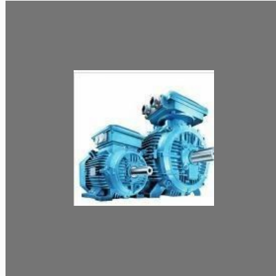
Process Performance Motors