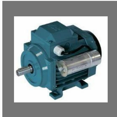
Single Phase Motors