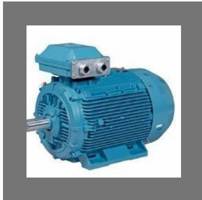
Permanent Magnet Motors