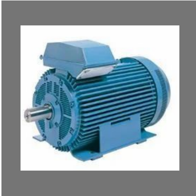
Open Drip Proof Motors