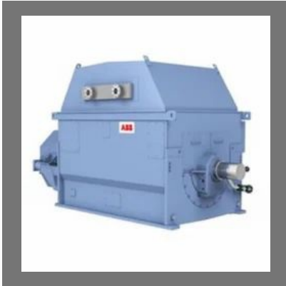
ABB Synchronous Motors