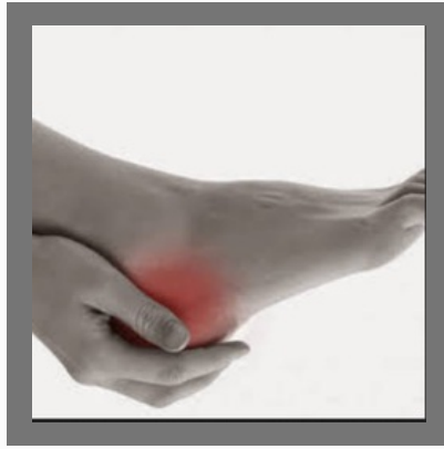
Ankle Physiotherapy Treatment Service