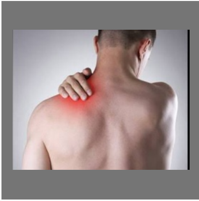
Shoulder Physiotherapy Treatment Service