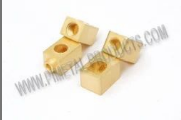
Brass Electrical Parts