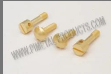
Brass Sealing Screws