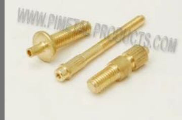
Brass Customized Parts