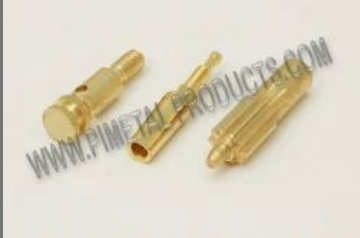
Brass Precision Components