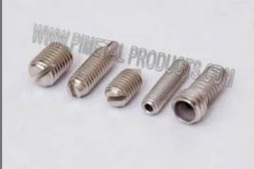
MS Grub Screws