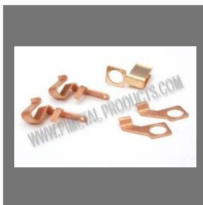
Sheet Cutting Parts