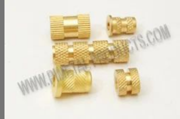
Brass Knurling Inserts