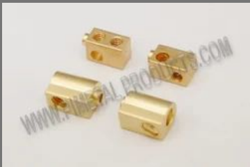
Brass Electrical Switch Parts