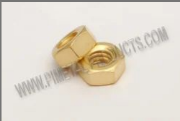
Brass Hex Nuts