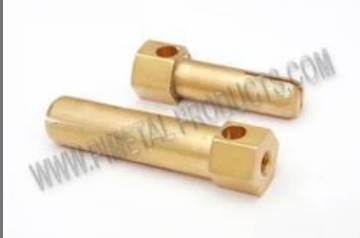
Brass Electrical Pins