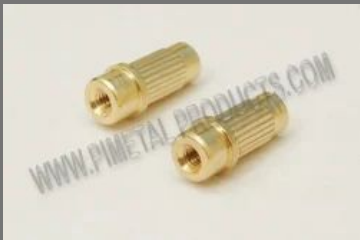
Brass Speedometer Terminal