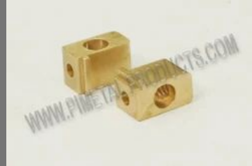
Brass HRC Fuse Parts