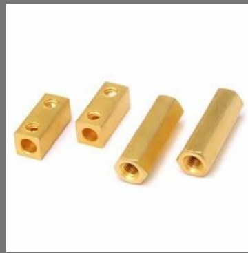
Brass Electrical Connector