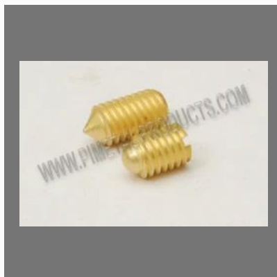
Brass Grub Screws