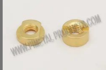
Brass Slotted Nuts