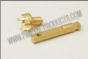
Brass Precision Components