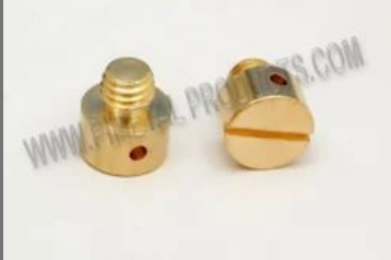
Brass Set Screws