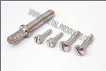
MS Knurling Screws