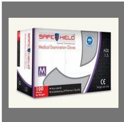
Powder Free Latex Examination Gloves