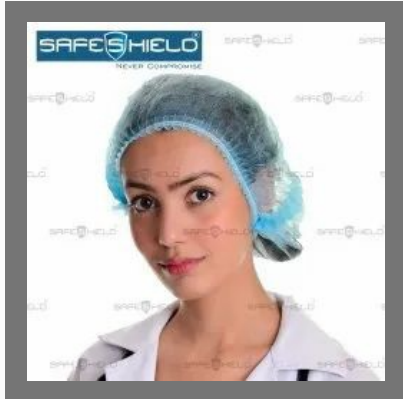
Disposable Bouffant Cap