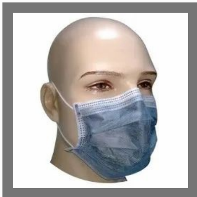
4 Ply Activated Carbon Mask