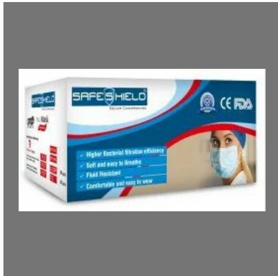
Safeshield 3 Ply BFE 99% Surgical Mask