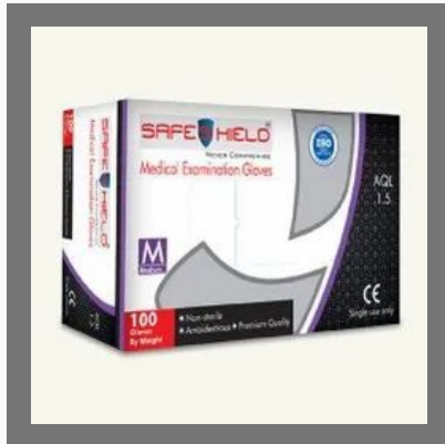
Safeshield Pre Powdered Latex Examination Gloves