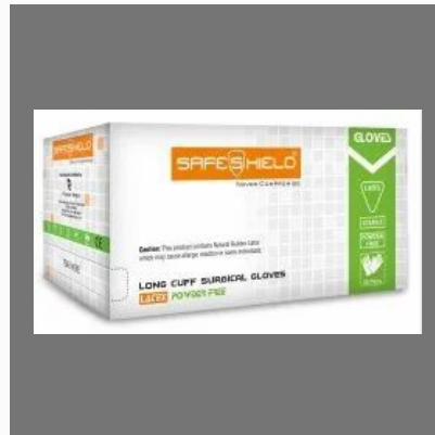
Safeshield Long Cuff Latex Surgical Gloves