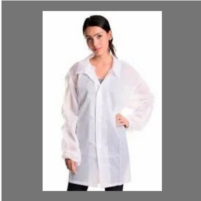
Disposable Lab Coat