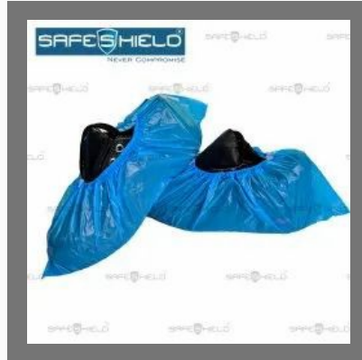
Disposable PE Shoe Cover