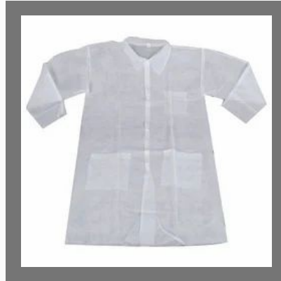
Disposable Lab Coat