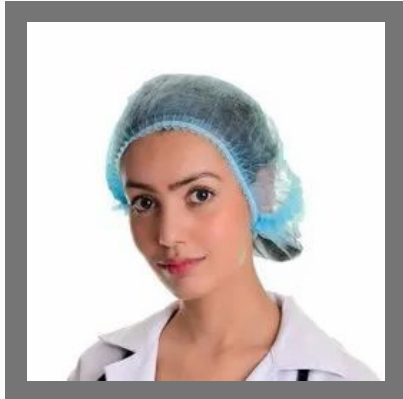
Safeshield Disposable Bouffant Cap