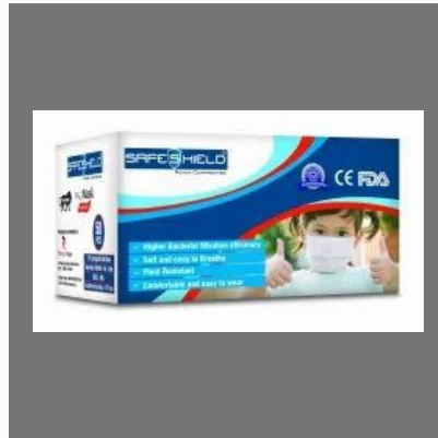
Safeshield 3 Ply Disposable Kids Face Mask With Meltblown Filter Bfe 99%