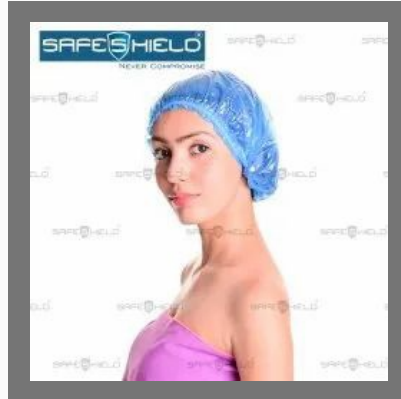
Disposable Shower Cap