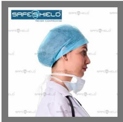
Disposable Surgeon Cap