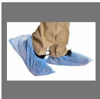
Non Woven Shoe Cover