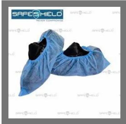
Disposable Non Woven Shoe Cover