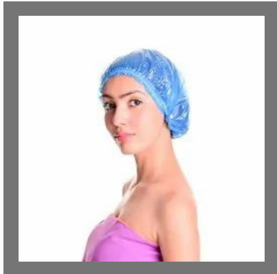
Safeshield Disposable Shower Cap