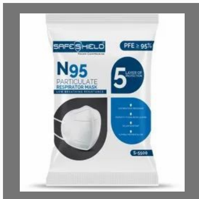
N95 Respirator Mask