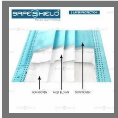
3 Layer Disposable Face Mask