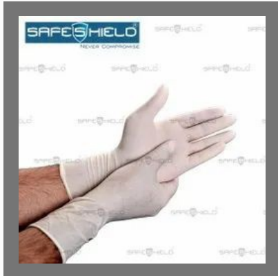
Latex Surgical Gloves