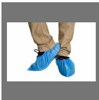
LDPE Shoe Cover