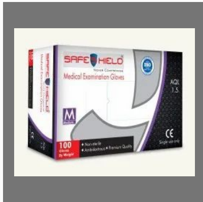
Safeshield Latex Examination Gloves