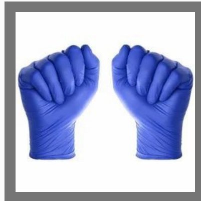
Nitrile Disposable Gloves