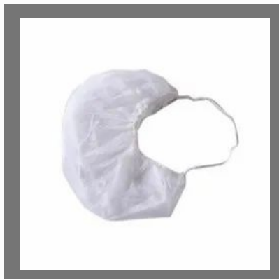
Disposable Beard Cover