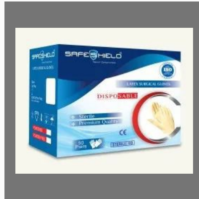
Pre Powdered Sterile Latex Surgical Gloves