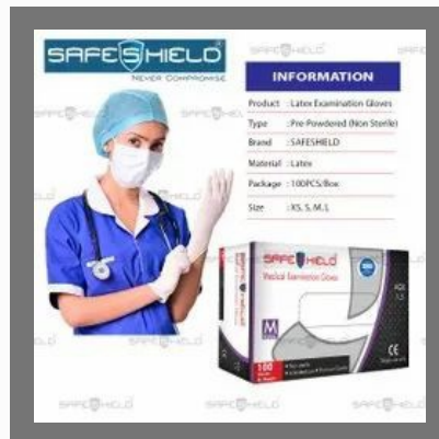
Latex Examination Gloves