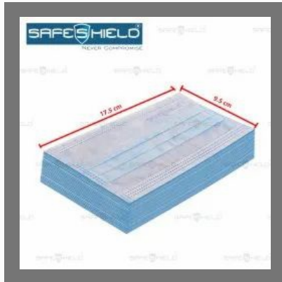
Disposable Face Mask