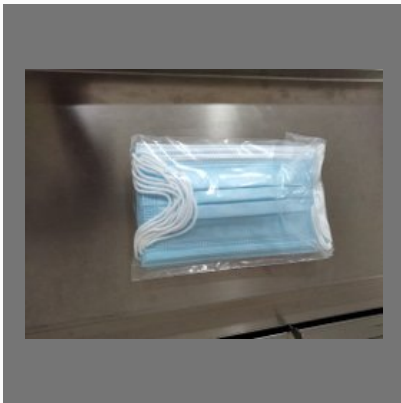
3 Ply Face Mask With Nose Pin