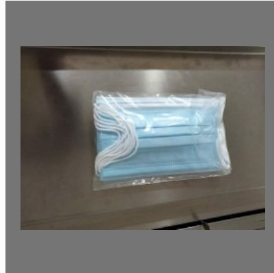
3 Ply Face Mask