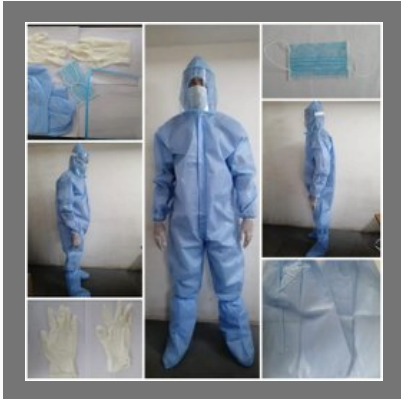
Ppe Kit With Gloves And Mask Set