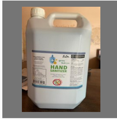
Approved Hand Sanitizer In Different Quantities 5 Litre