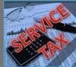
Service Tax Matters>Returns & Consultancy