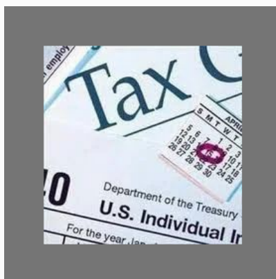
NRI Tax Matters