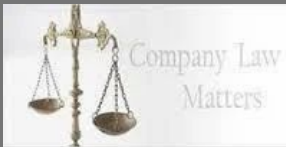
ROC (Company Law Matters)