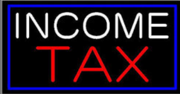
Income Tax & Wealth Tax Returns & Tax Planning