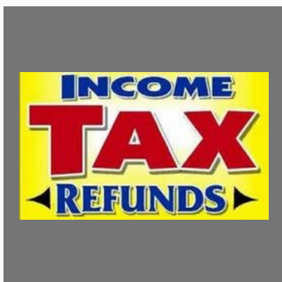
Income Tax Refunds