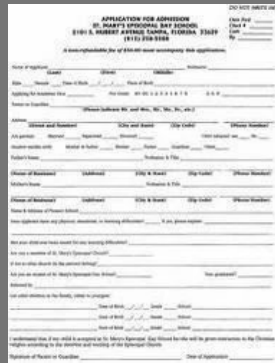
Application & Correction In Pan No