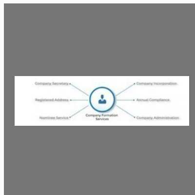
Formation of Private & Public Limited Companies.