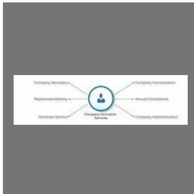
Formation of Private & Public Limited Companies.