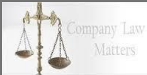
ROC (Company Law Matters)