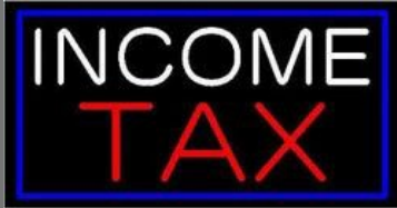
Income Tax & Wealth Tax Returns & Tax Planning