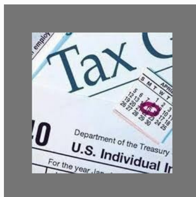
NRI Tax Matters