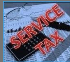
Service Tax Matters>Returns & Consultancy