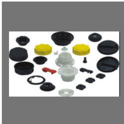
Injection Molded Components