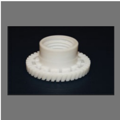
Delrin Injection Molded