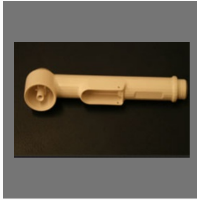
Extra Long Plug For Injection Moulding