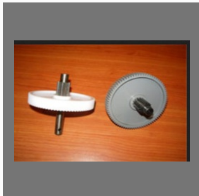
Peek Injection Molded