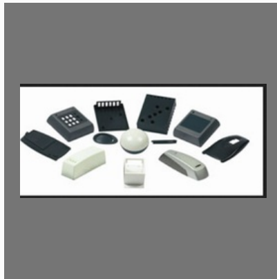
Plastic Housing Moulding