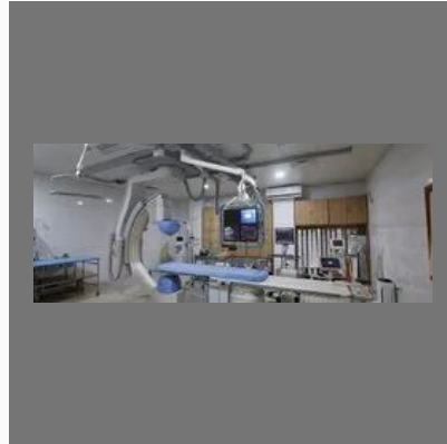
Anesthesiology and Critical Care