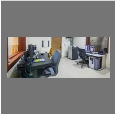
Radio Diagnosis And Imaging