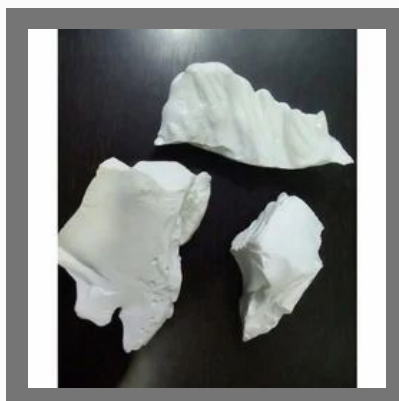
White Polyester Lumps