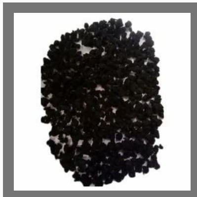
Black Polyester Popcorn