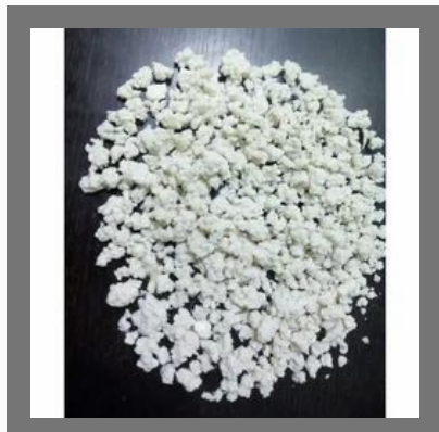
White Polyester Popcorn