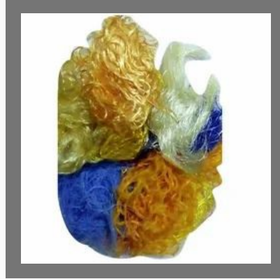
Polyester Colored Yarn Waste