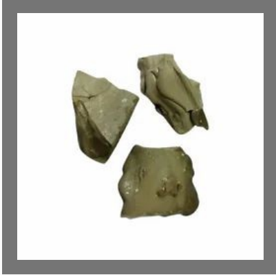
Colored Polyester Lumps