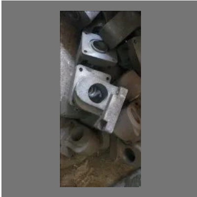
Non Return Check Valve