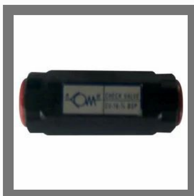
Non Return Check Valves