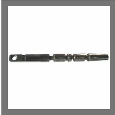
L&T Machine Spool