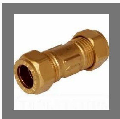
Non Return Valves