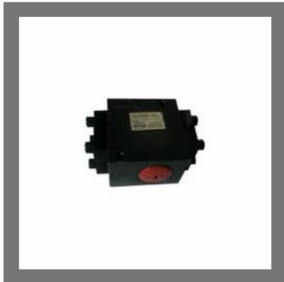
Pilot Operated Check Valves