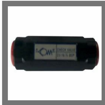
Hydraulic Check Valves