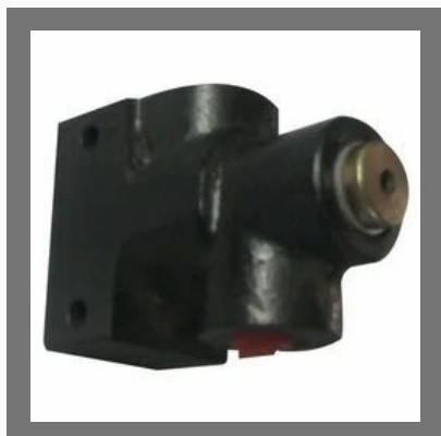
Line Type Housings