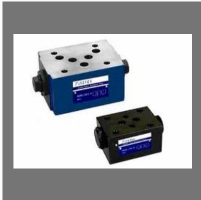
Pilot Operated Check Valves