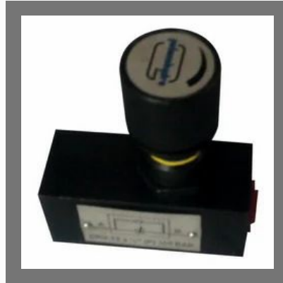
Flow Control Valves