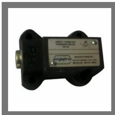
Sub Plate Type Housings