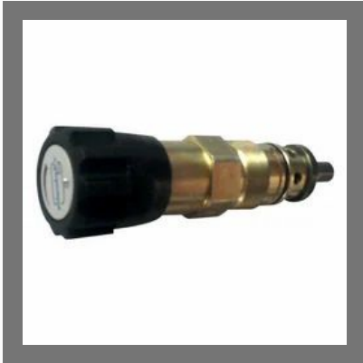
Pressure Relief Valves