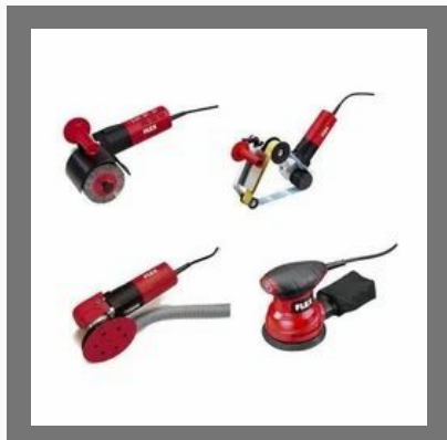
Surface Finishing Tool