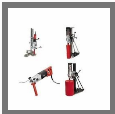
Concrete Core Cutting Machines