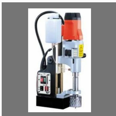
Magnetic Metal Drilling Machine