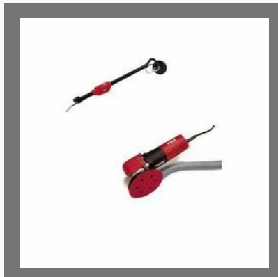
Drywall And Wall Sander