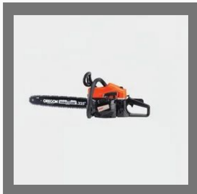
Petrol Chain Saw - 50CC