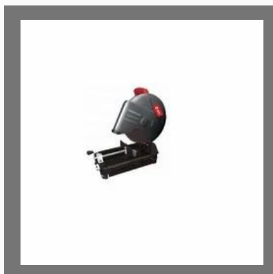
Power Chop Saw