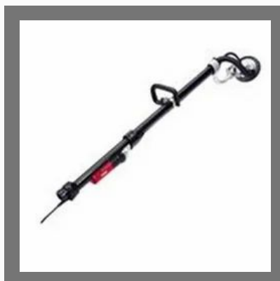
Floor And Wall Finishing Tool