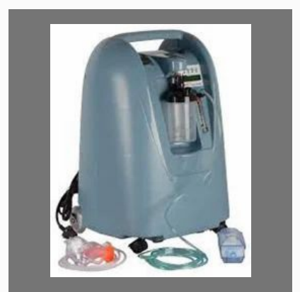
Portable Oxygen Concentrator