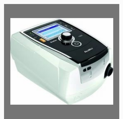
Resmed Stellar 100 Ventilator