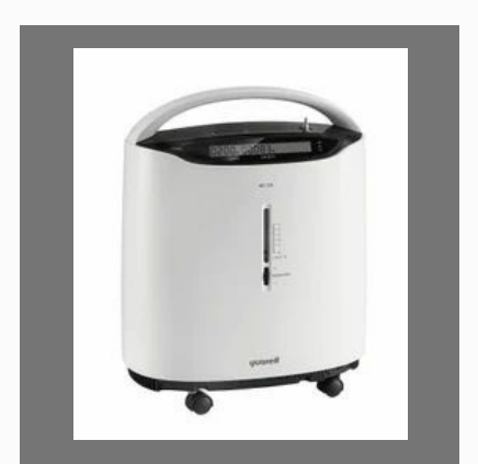
Yuwell Oxygen Concentrator