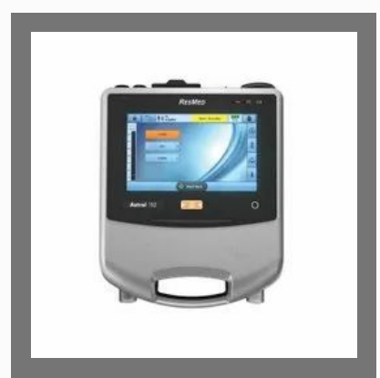
Astral 150 Non - Invasive Ventilator