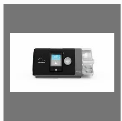
ResMed AIRSTART 10 CPAP