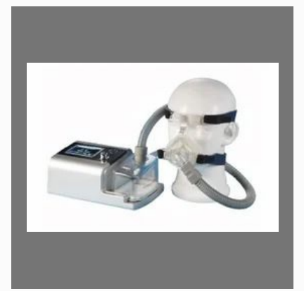
Positive Airway Pressure CPAP Machine