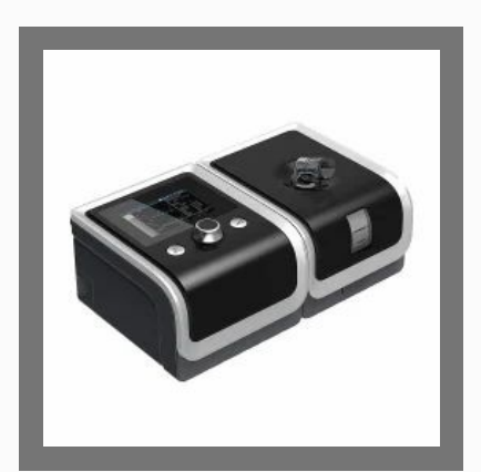
BMC G3 B30VT BiPAP Machine