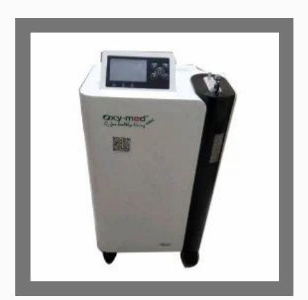
Oxymed Oxygen Concentrator