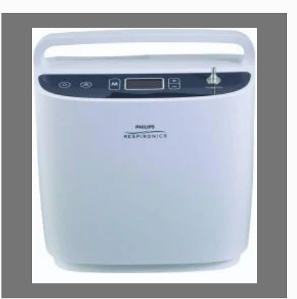
OXYGEN CONCENTRATOR 5 LPM 8F-5A YUWELL