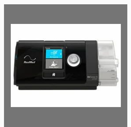
Resmed Airsense 10 Auto CPAP