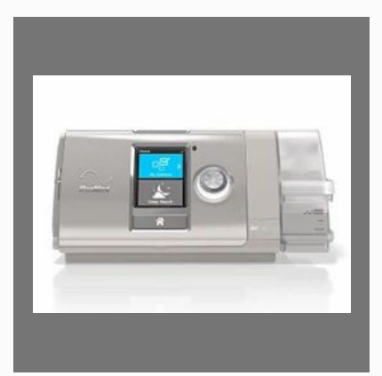
ResMed BiPAP Machine