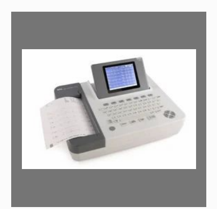
BPL ECG Machine