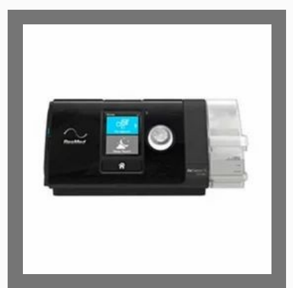
ResMed AirSense 10 Auto Set CPAP