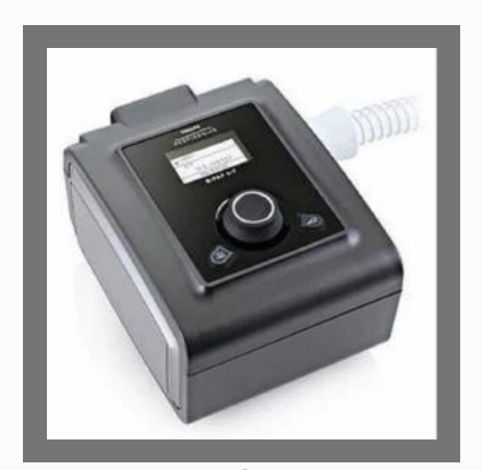
Philips BiPAP S/T Machine