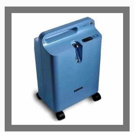
Philips Everflo Oxygen Concentrator 5LPM