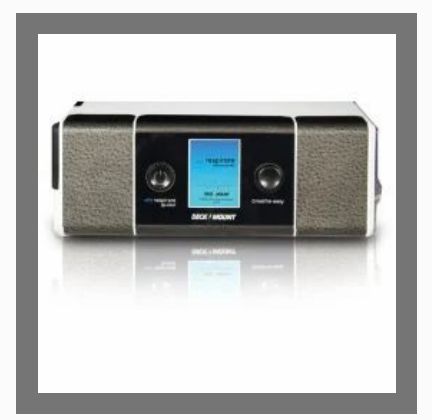
Bmc Y30t Bipap Machine