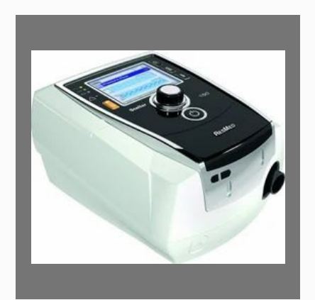
Stellar 150 Ventilator