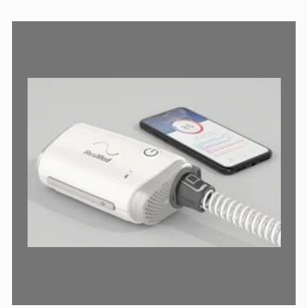
ResMed Air Mini CPAP Machine