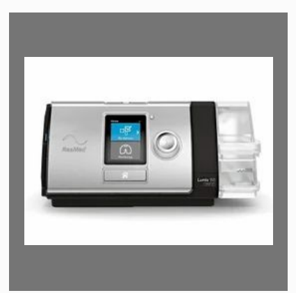
Lumis 150 Non Invasive Ventilator