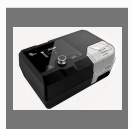
BMC RESmart GII Auto CPAP Machine (G2)