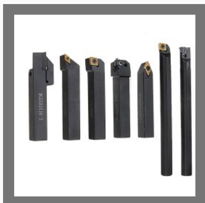
Cnc Turning Tool Holder