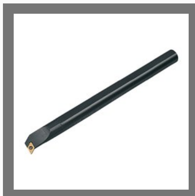
Insert Boring Bars