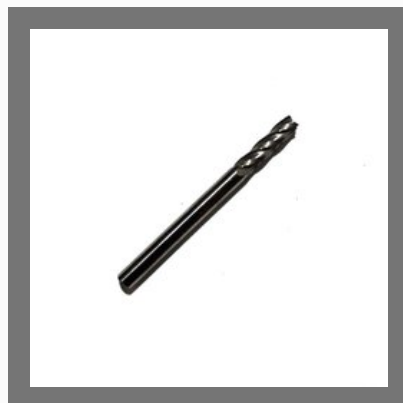
Carbide Milling Cutters