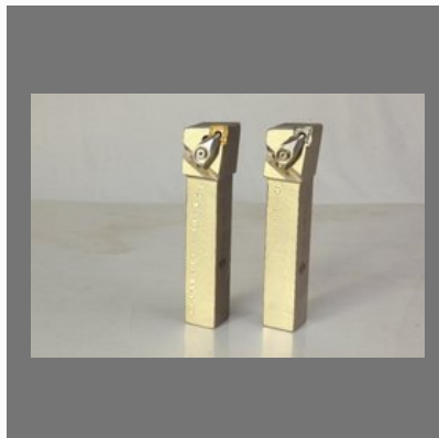
CNC Cutting Tool Holder