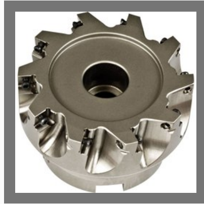
SDKT Milling Cutter