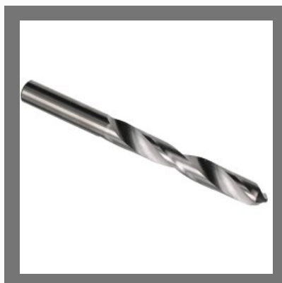
Carbide Drill Bit