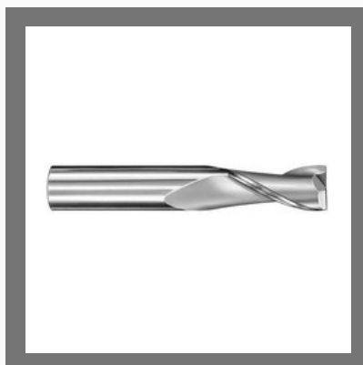
Solid Carbide Tools