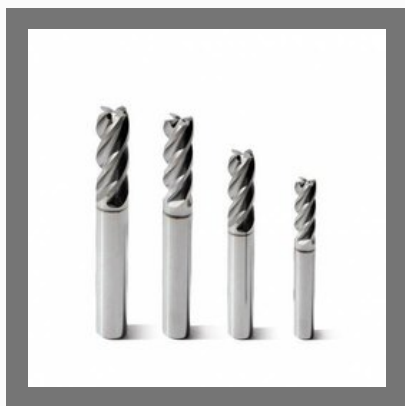
HSS Cutting Tools