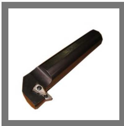
Metal Cutting Tools