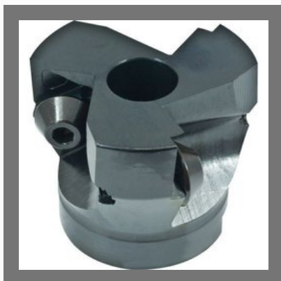
50mm Face Milling Cutters