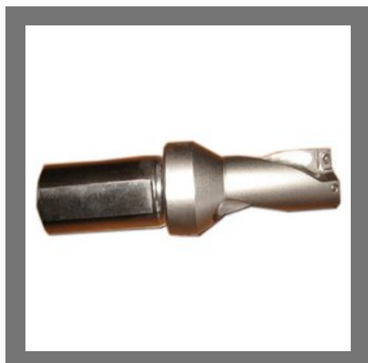
U Drill Bit