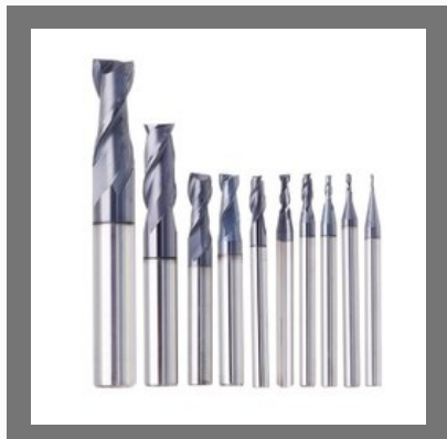
Solid Cutting Tools