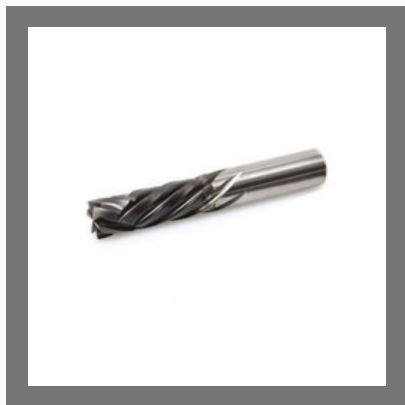
VMC Cutting Tools