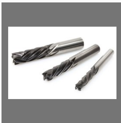
Carbide Cutting Tools