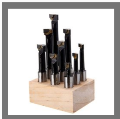
Boring Bars Set