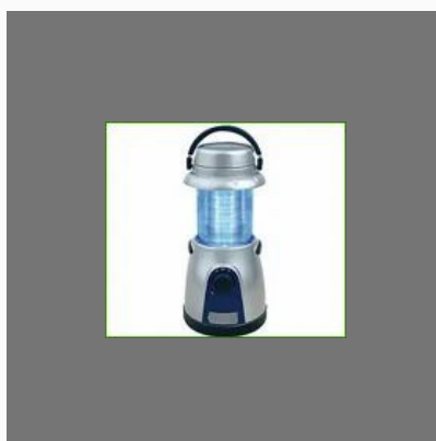
Solar Emergency Lights