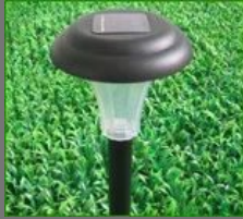
Solar Emergency Lights