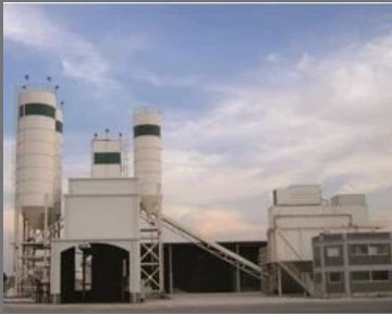
Drying And Cooling Systems