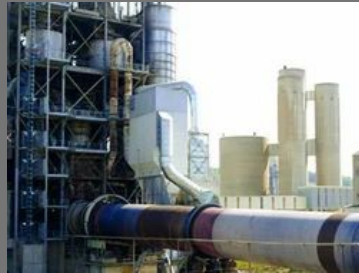
RDF Feeding Systems