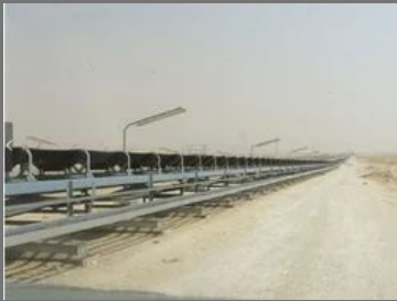
Cross Country Conveyors